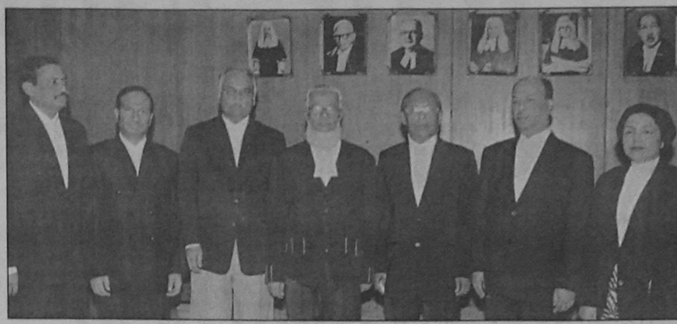
Six newly appointed additional judges of the High Court pose for photograph with Chief Justice MM Ruhul Amin after taking oath at the judges' lounge of the Supreme Court in the city yesterday.

Bangladesh Manobadhikar Samonny Parishad organises a roundtable on Representation of Peoples Ordinance and candidature of individuals and NGO chief executives in elections. Venue: IDB building auditorium. Time: 10:00am.