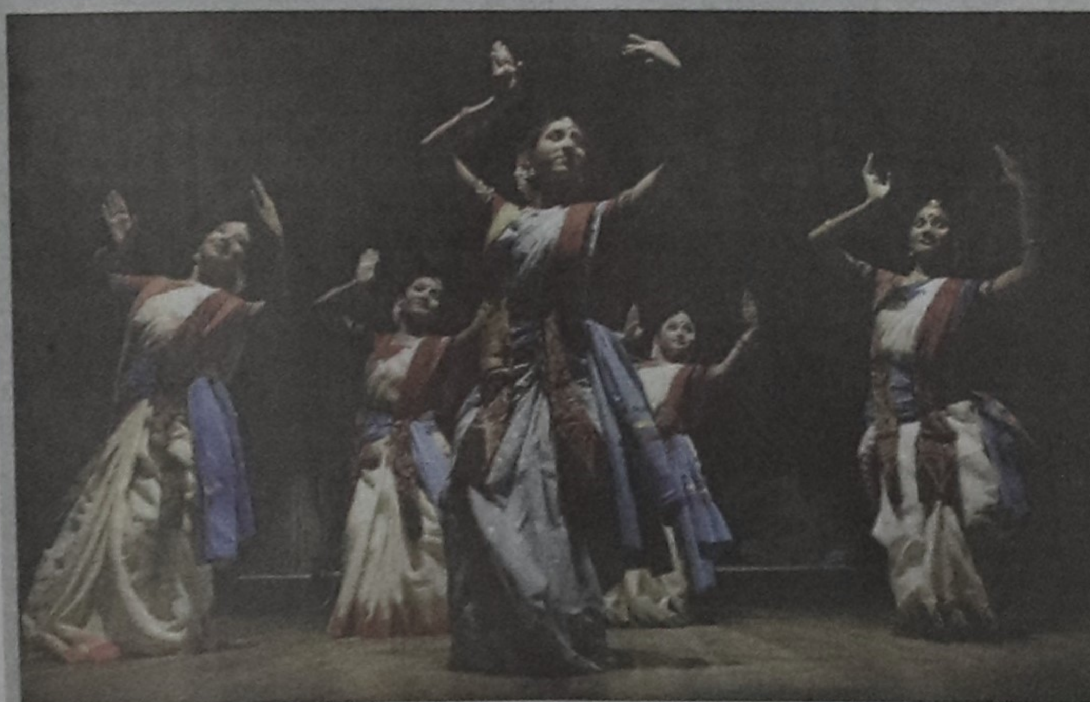
Artists perform a group dance at the programme.

The programme also featured several group songs, including "Alor amol kamol khani," "Aaj dhaner khetey," "Aamra bendhechhi kasher guchchho" and "Megher koley roud heshechhey."