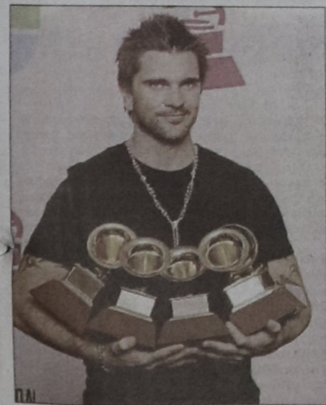
Juanes holds his five awards backstage at the 9th annual Latin Grammy Awards.

Colombian rock star Juanes emerged as the new king of the Latin Grammys on November 13, sweeping the five awards for which he was nominated and becoming the new record holder.