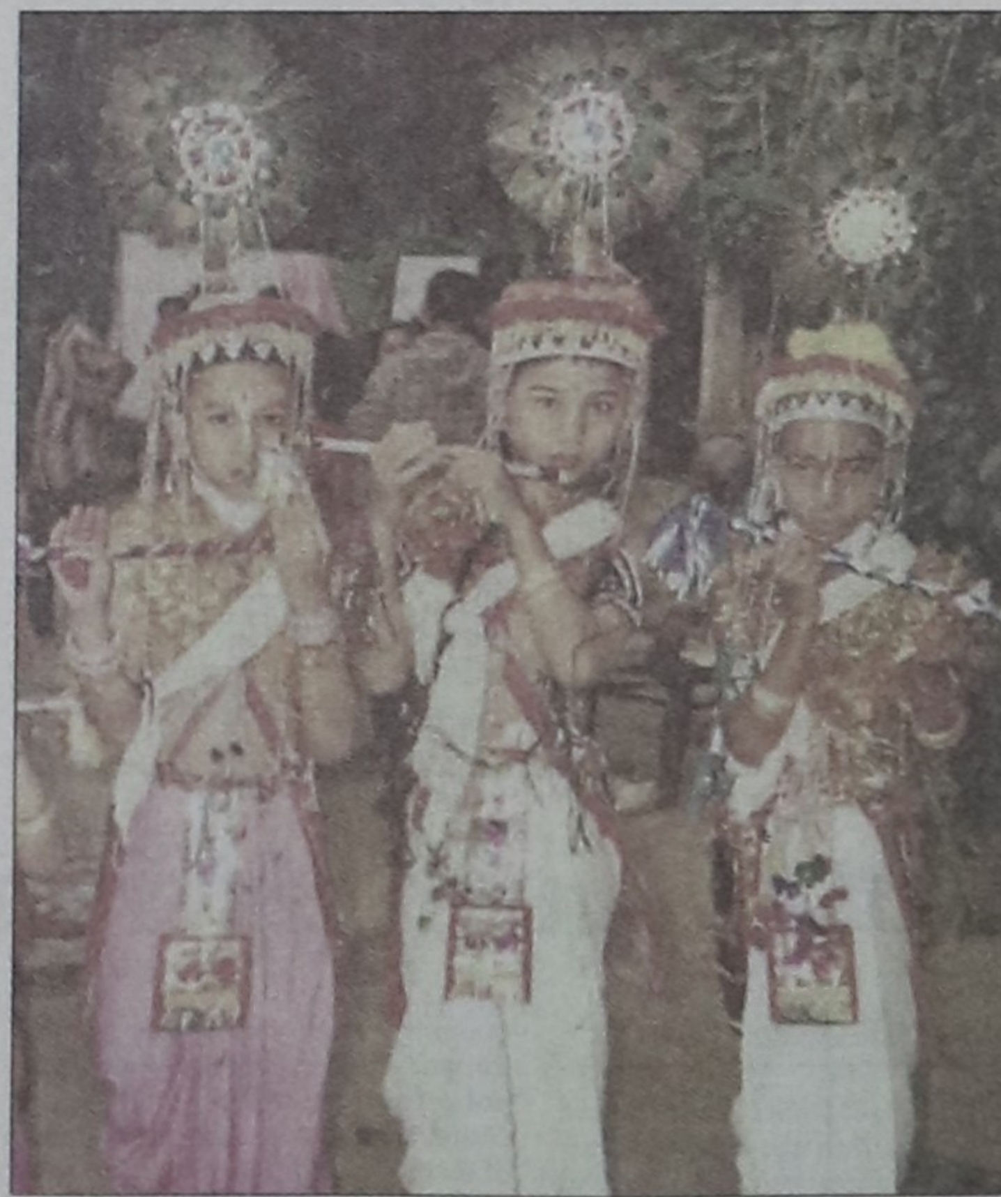
Young Manipuris in Sri Krishna costume at the 'Rash Leela.'

'Mela' (fairs) were also held at the two festival venues. The range