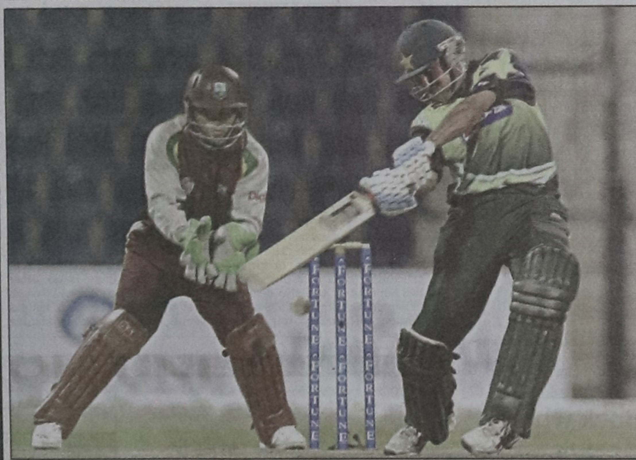
Pakistan batsman Younus Khan forces the ball off the back foot during his enterprising 56 against West Indies in the first one-dayer at the Sheikh Zayed Cricket Stadium in Abu Dhabi on Wednesday.