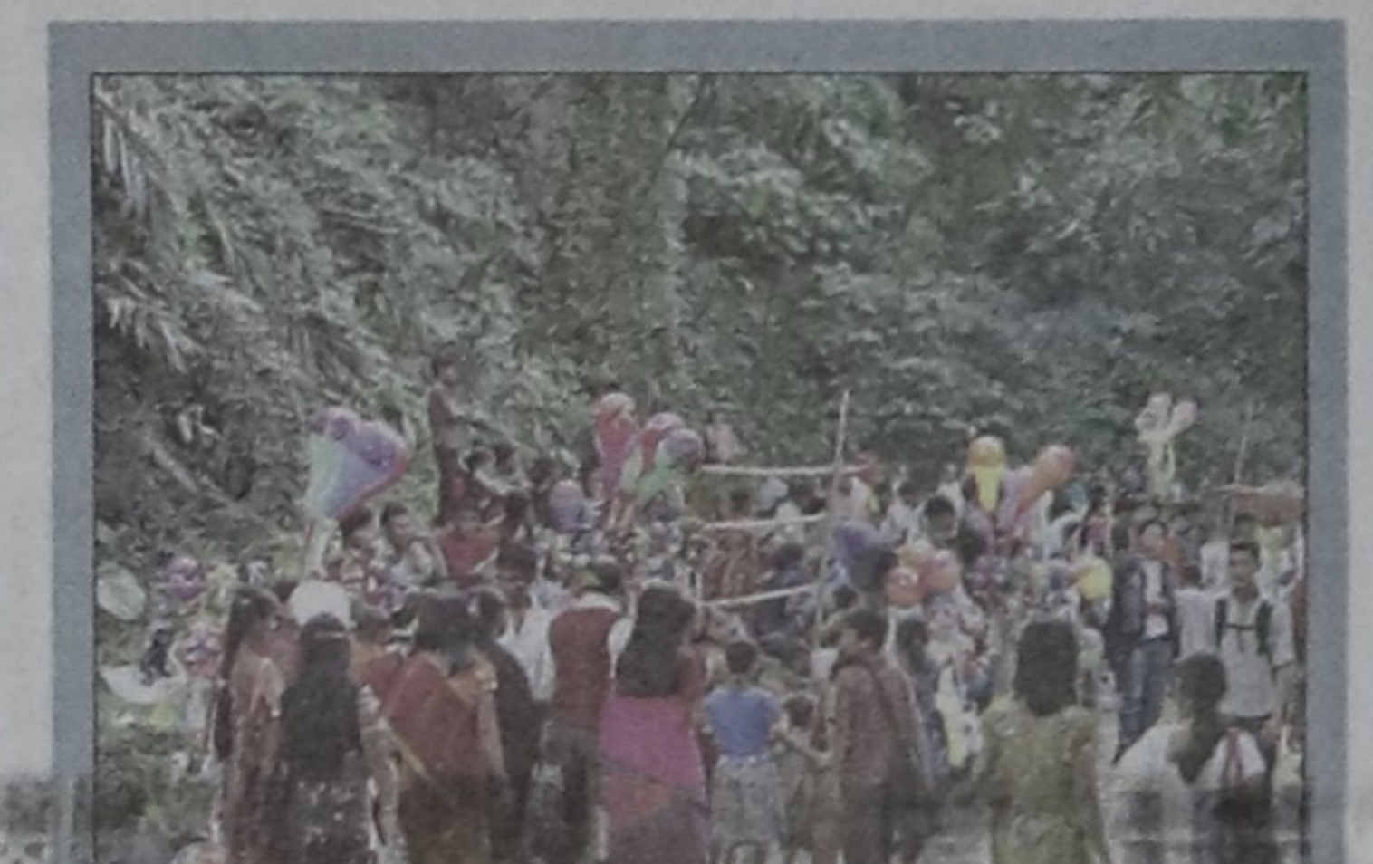
A three-day long 'mela' began from November 12 at Alutula area under sadar upazila in Khagrachhari. According to the organisers, the 'mela' features around 100 stalls with an array of products including toys, local handicrafts made of wood, bamboo and wicker.

The organisations that participated at the programme are, Udichi, Sammilita Natya Parishad, Nazrul Academy, Charon Sangskritik Kendra, Prantik Parshad, Nabashikha Natya Dal, Natya Mancha Shopan, Anandaloke, Sruti, Nandik Natyadal, Charubak, Theatre Sylhet, Natyalok, Theatre Bangla, Shikor, Mohona, Sylhet Lekhok Samity, Poets Club, Shishu Kishore Mela, Muktiyoddha Sangsad, Pathakoli, Amra Muktiyoddhar Santan, Muktiyoddha Juba Command, Chhatra Command, Paromita Sahitya Sangsad, Nriyasarani and Chirontan.