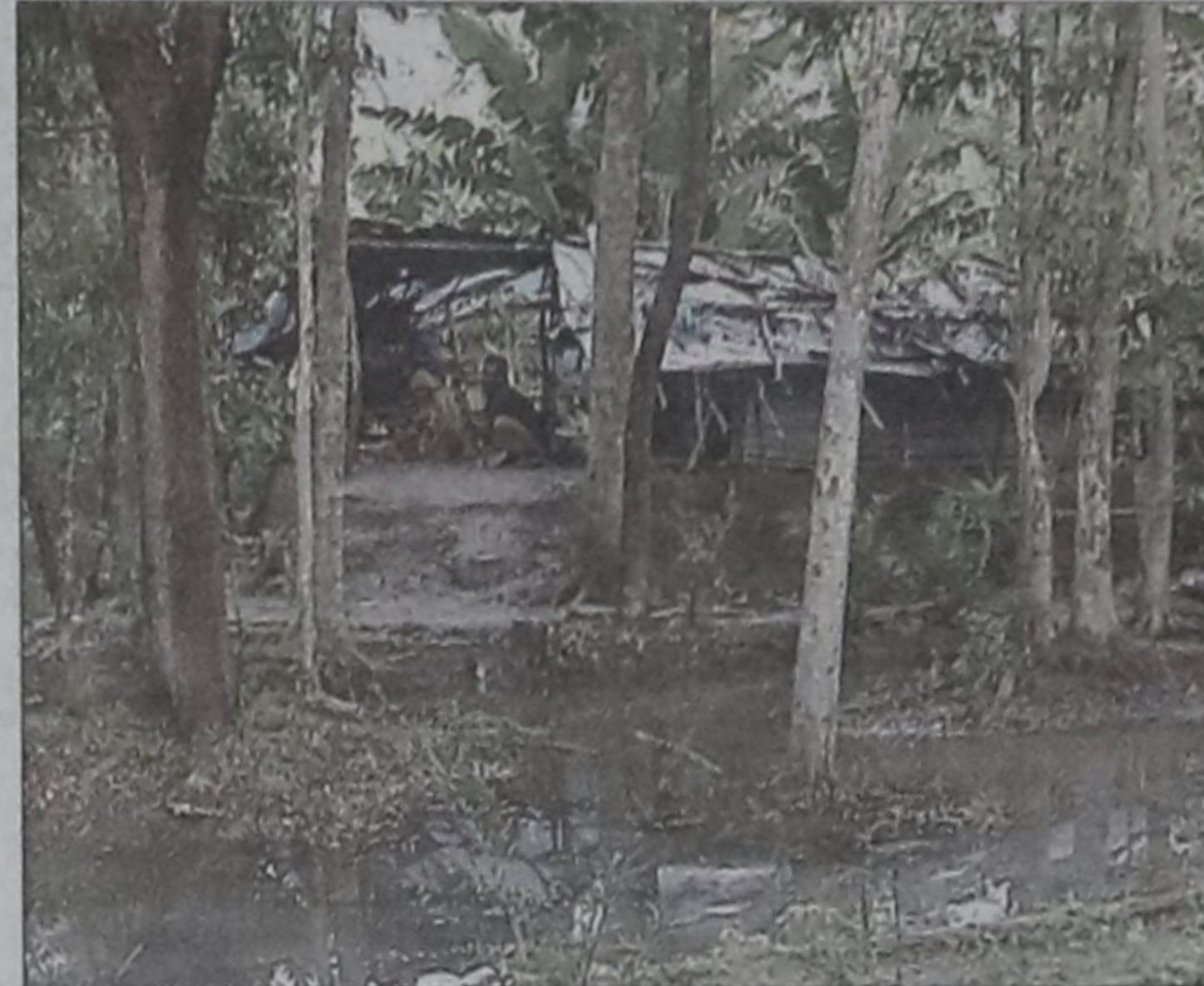
A scene from the film