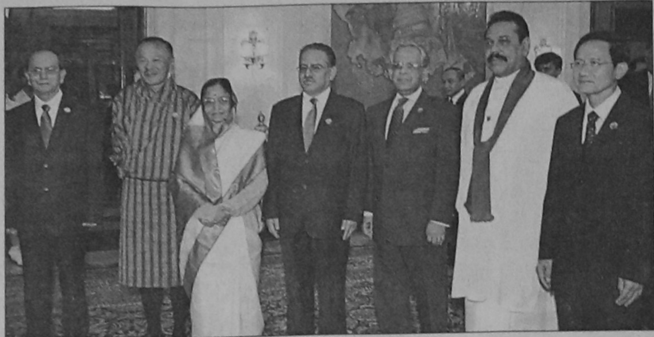
Indian President Pratibha Patil (3-L) poses with Prime Minister of Myanmar General Thein Sein (L), Prime Minister of Bhutan Lyonchen Jigmi Y. Thinley (2-L), Prime Minister of Nepal Pushpa Kamal Dahal "Prachanda" (C), Bangladesh Chief Adviser Fakhruddin Ahmed (3-R), President of Sri Lanka Mahinda Rajapaksa (2-R) and Prime Minister of Thailand Somchai Wangsat (R) during a meeting at the Presidential Palace in New Delhi yesterday. Heads of state and ministers from Bangladesh, Nepal, Myanmar, Sri Lanka, Bhutan and Thailand are in India to take part in the two-day summit, which is being held in the Indian capital.