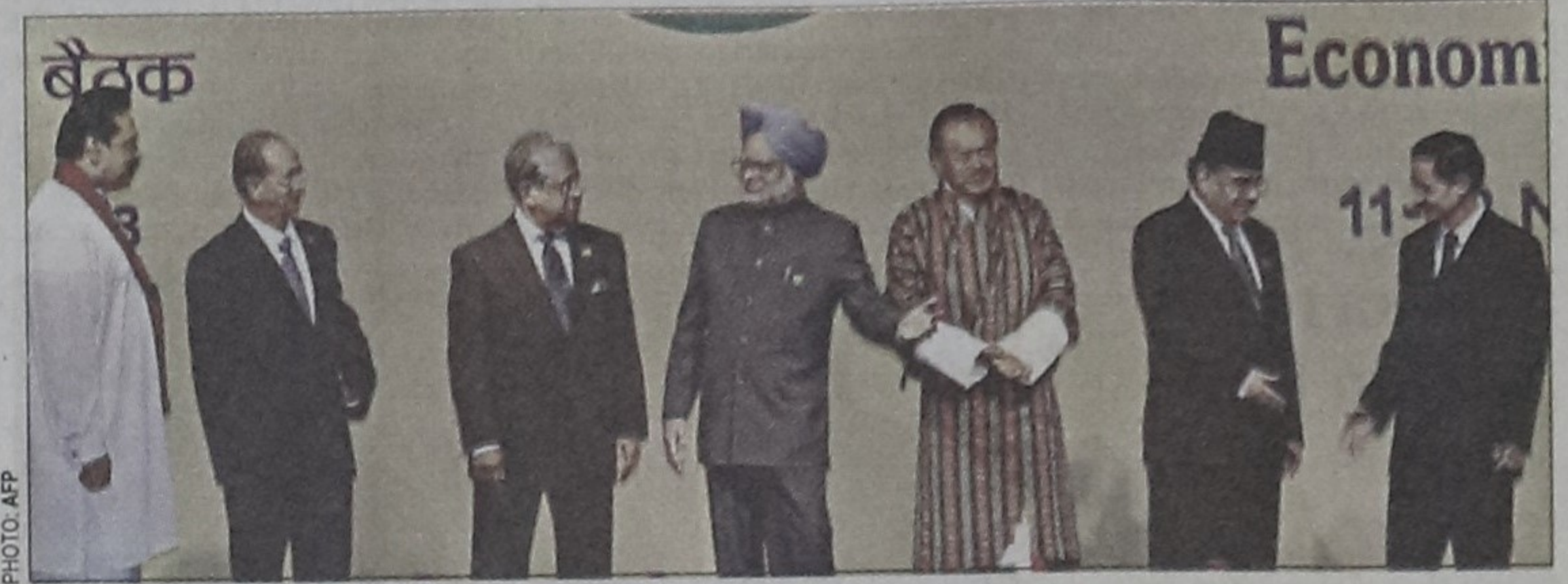
Leaders of Bay of Bengal Initiative for Multi-Sectoral Technical and Economic Cooperation (Bimstec) pose for photos prior to the inauguration of the second summit of the group in New Delhi yesterday.

AL urges EC to let its allies use 'boat' symbol