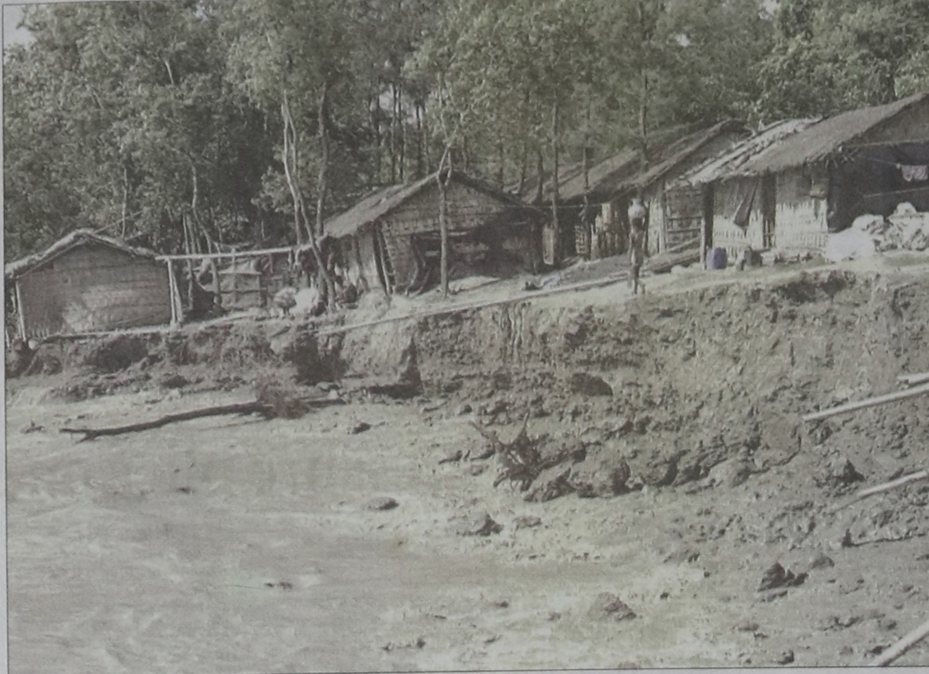
ZOBAER HOSSAIN SIKDER

Sources said the breach has developed at least at 20 points of the 21.70 kilometre embankment stretching from city's Naval Academy to Fouzdarhat coastal area under Sitakunda upazila due to repeated upsurges during depressions in the sea.