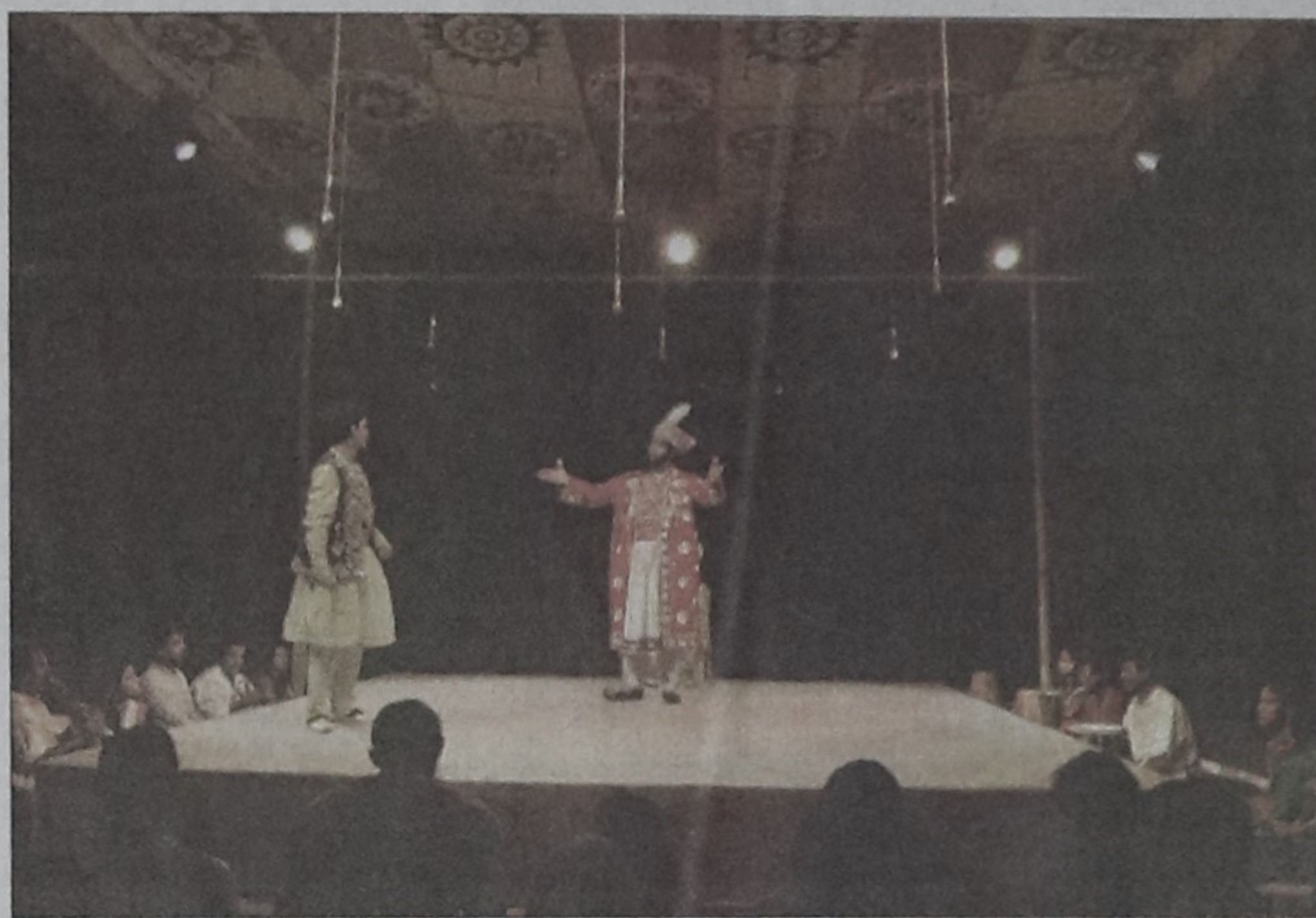
DU students staged a 'jatrapala' titled "Shah Jahan" on November 8 at the ongoing theatre festival at TSC auditorium.