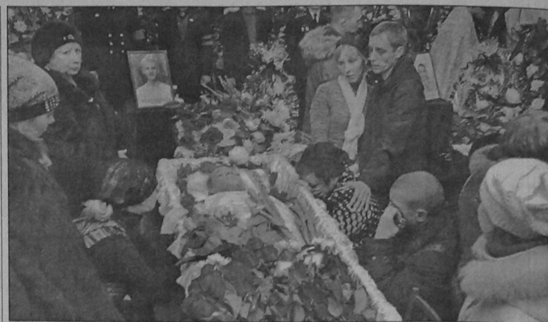
People cry at a funeral ceremony for some of the twenty who died on board the Akula-class submarine, in Komsomolsk-on-Amur yesterday. Twenty people, including three naval officers and 17 civilians, were killed on November 9 by inhaling poison freon gas after the vessel's fire-extinguishing system accidentally activated during sea trials in the Sea of Japan.

McConnell is a retired Navy admiral who took over as national intelligence director in February 2007. He is the second person to hold the job, which was created following the September 11, 2001 terrorist attacks in the United States.