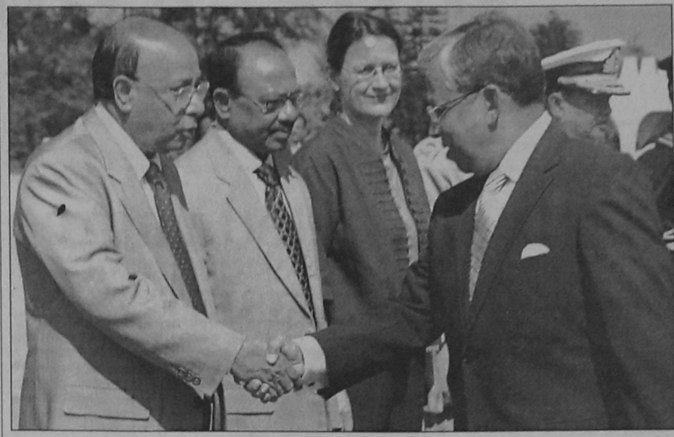
Members of Council of Advisers see off Chief Adviser Fakhruddin Ahmed at Zia International Airport in the city yesterday prior to his departure for New Delhi to attend the second summit of the Bimstec. (Story on Page 1)