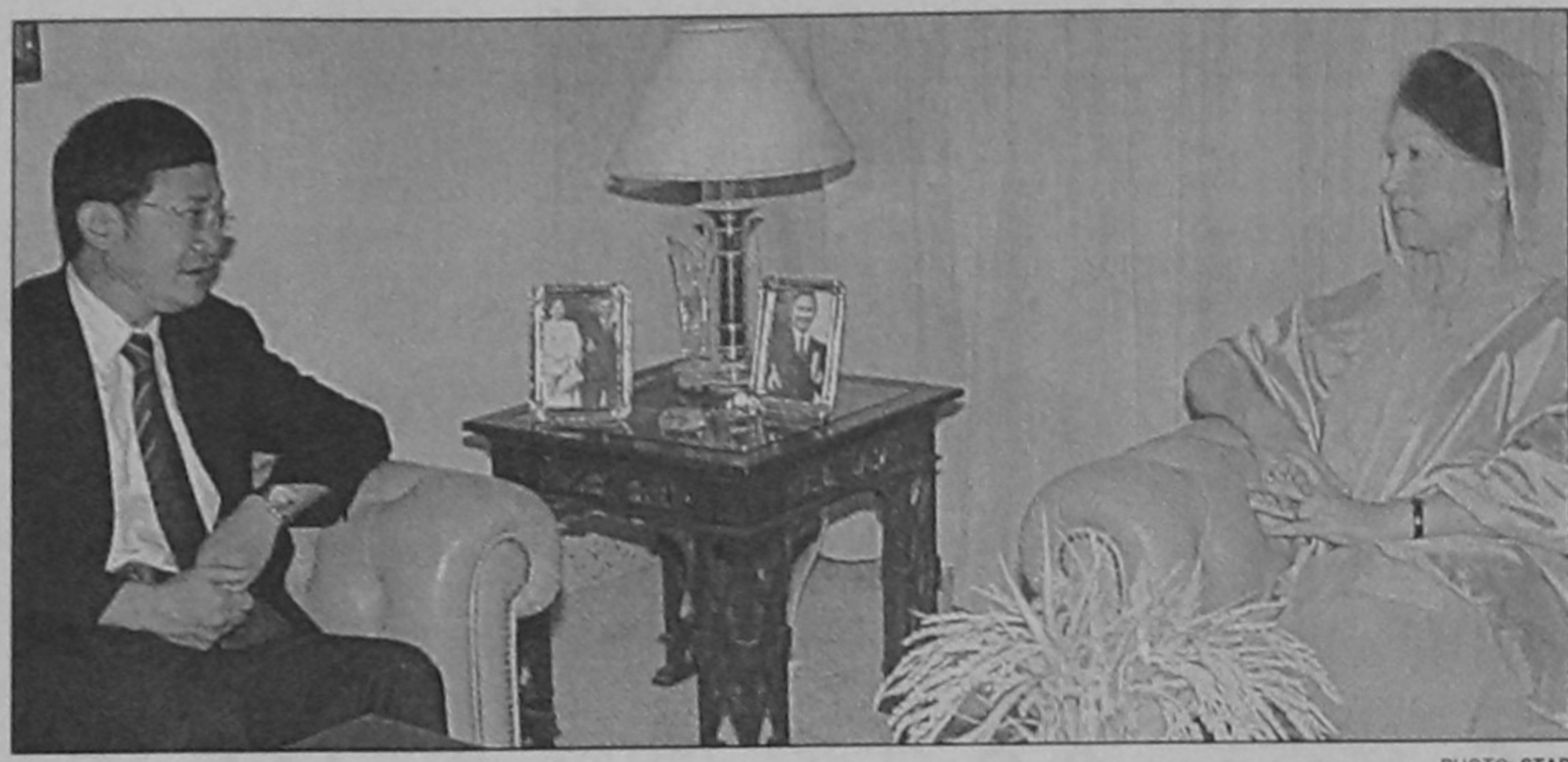
Chinese Ambassador Zheng Qing Dian calls on BNP Chairperson Khaleda Zia at her Gulshan office in the city yesterday. (Story on Page 16)

Food will also be distributed among the destitute.