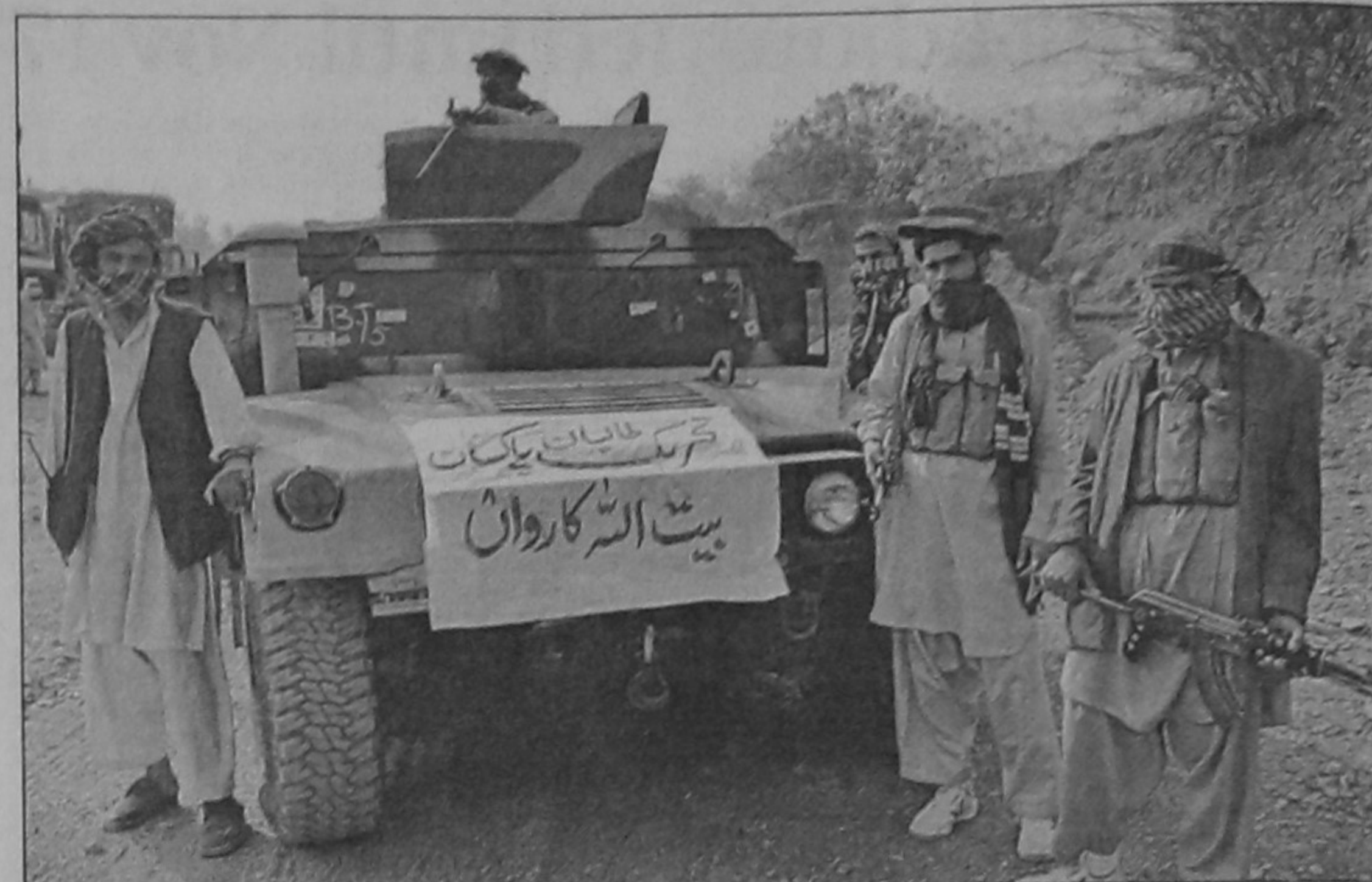
Armed militants of Tehreek-e-Taliban Pakistan (TTP) pose for photographs next to a captured armoured vehicle in the Pakistan-Afghanistan border town of Landikotal Monday after they hijacked supply trucks bound for Afghanistan. TTP militants in northwest Pakistan hijacked 13 trucks carrying supplies for coalition forces in Afghanistan as they passed through the Khyber Pass.

"We feel that the strikes are an intrusion on our sovereignty, which are not appreciated by the people at large, and the first aspect of this war is to win the hearts and mind of the people," Zardari said.