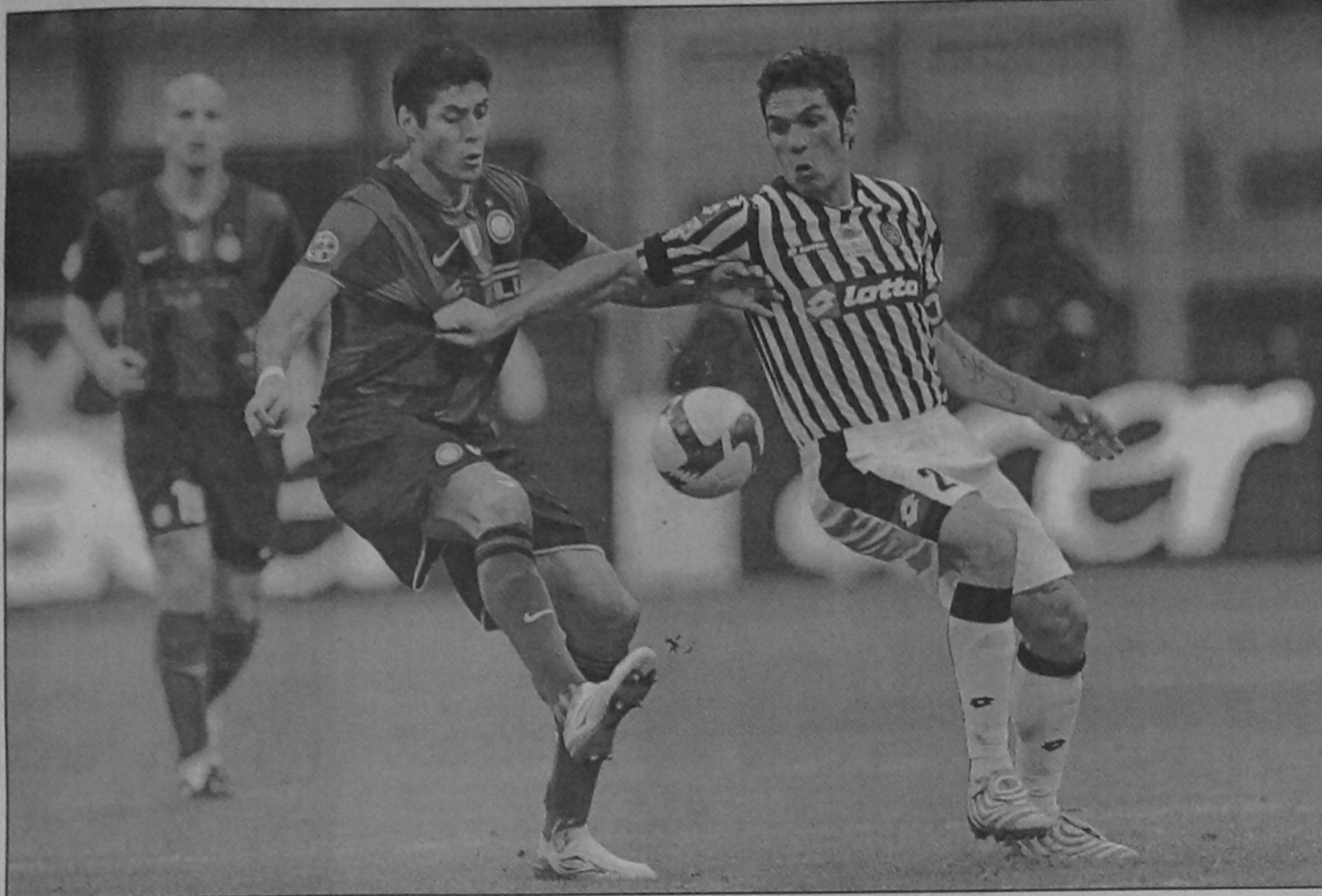
Inter Milan striker Julio Ricardo Cruz (C) fights for the ball with Udinese midfielder Gaetano D'Agostino during their Serie A encounter at San Siro on Sunday. Cruz scored an injury-time winner to take Inter to the top of the league.