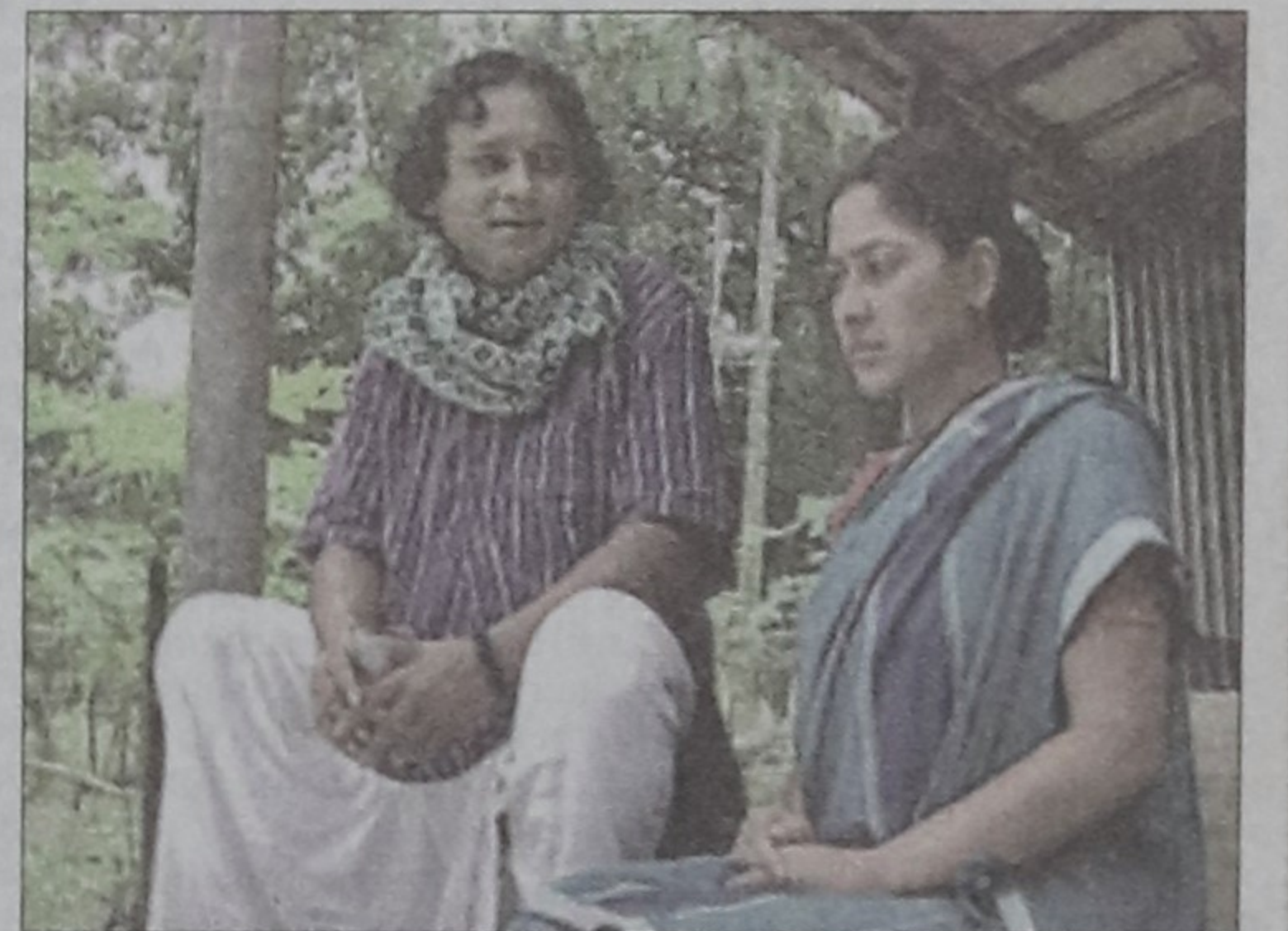
A scene from "Mayur Bahon."

Young and old alike, work to produce a successful play, which reflects the simple dreams of the villagers. The story is marked with several incidents such as the