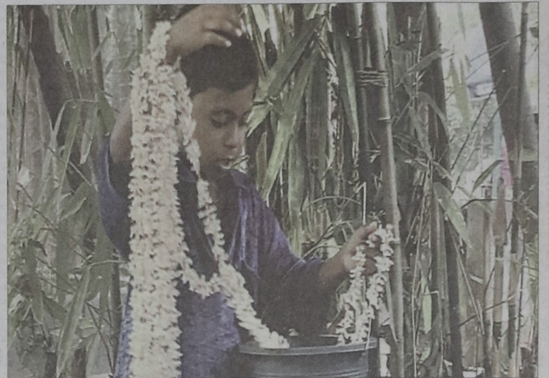
A scene from "Park-er Jibon."

A short film featuring a glimpse into the life of a child flower vendor will be screened at the 13th Tehran International Short Film Festival, says a press release.