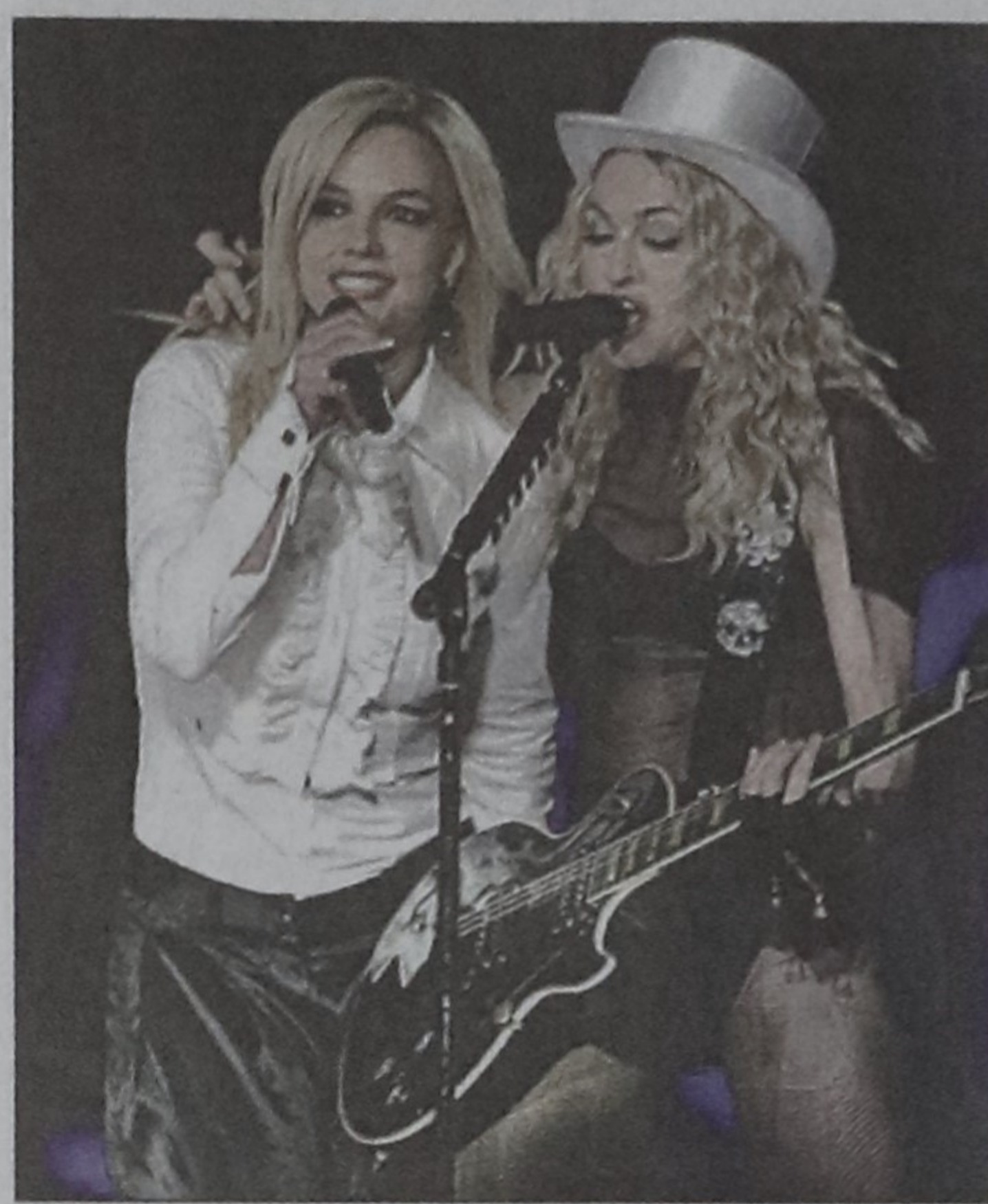
Madonna, with special guest singer Britney Spears, performs during her "Sticky and Sweet Tour" at Dodger Stadium in LA.

At the same time, she has spent much of her quarter-century in the limelight hammering away at one central idea: the embrace of all kinds. "We have so much to celebrate," Madonna announced near the end of Thursday's show, the president-elect's face on the stadium screens eliciting huge cheers from the celebrity-studded audience, which included such bold-faced names as Jennifer Lopez, Drew Barrymore and Fergie. "There is one little disappointment, though. I'm sorry to hear that Proposition 8 passed. But we