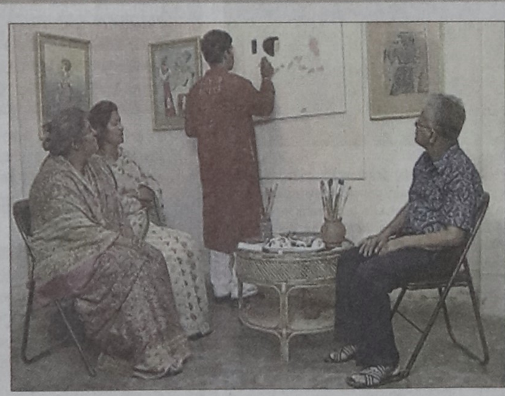
The Winner On Channel i at 6:20 pm Documentary on differently-abled children, directed by Fahmidul Islam