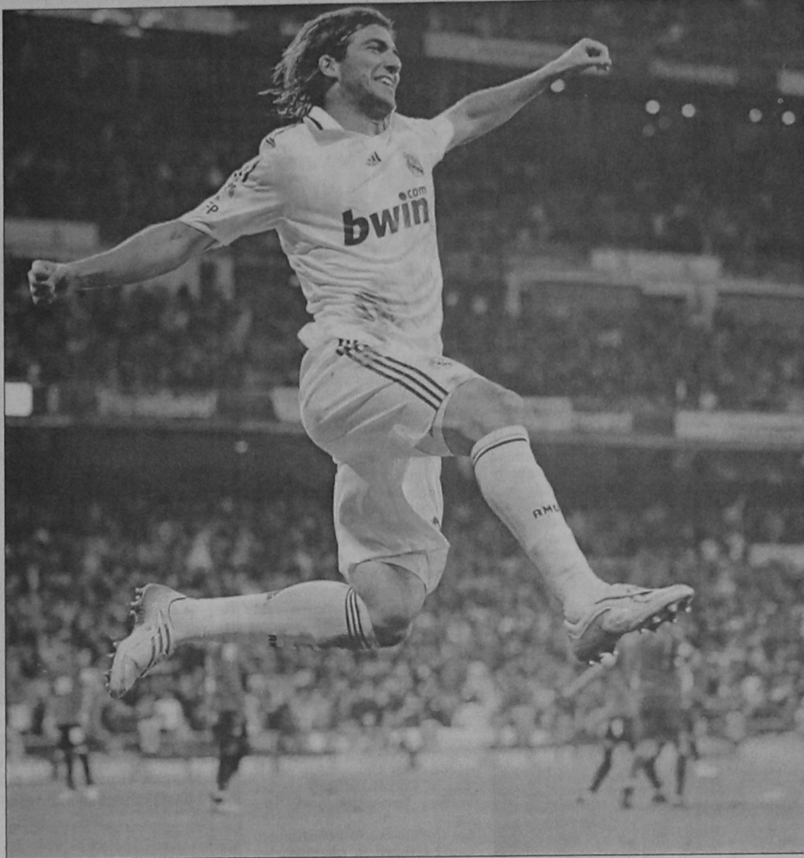
Real Madrid's Gonzalo Higuain (L) and Barcelona's Samuel Eto'o (R) are both ecstatic at scoring their fourth goals during their Primera Liga ties against Malaga and Valladolid respectively. Real rode on Higuain's goals to see off a spirited Malaga 4-3 at the Santiago Bernabeu while Eto'o was absolutely dominating in Barca's thumping 6-0 win at the Nou Camp on Saturday.

"He's doing what I did four years ago," said ex-Germany boss Klinsmann, who also sought early contact with his best players after taking the national hot seat in 2004.