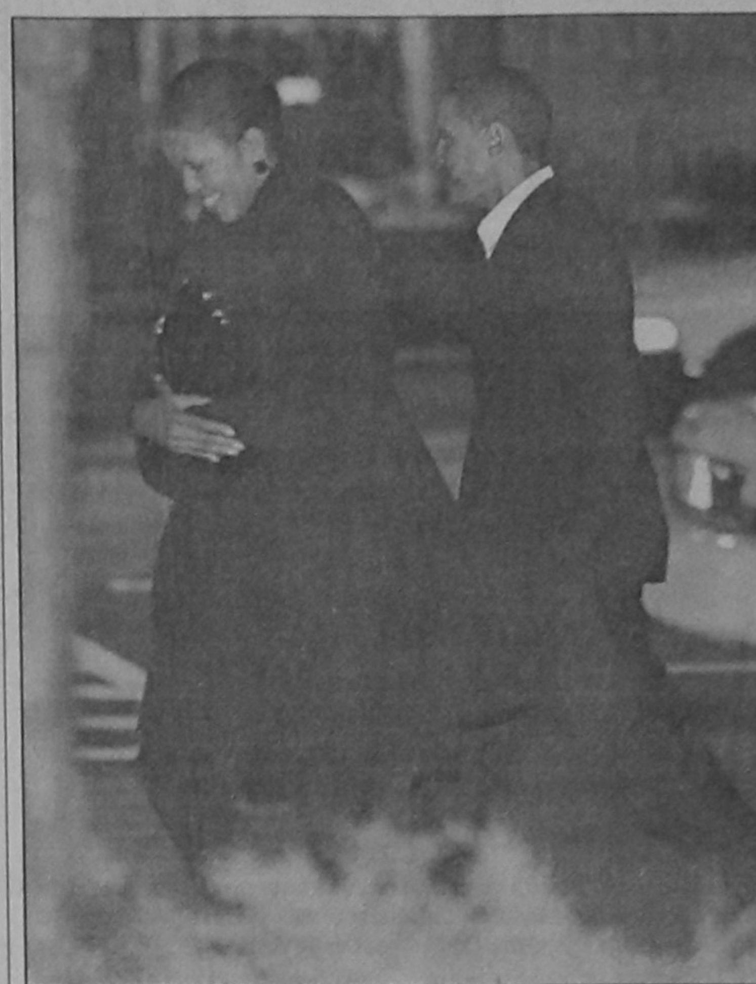
US President-elect Barack Obama and his wife Michelle leave Spiaggia restaurant after having dinner on Saturday in Chicago, Illinois.

He said those who had robbed the country should be held accountable. Nawaz also said the government should review the reasons behind terrorism in the country.