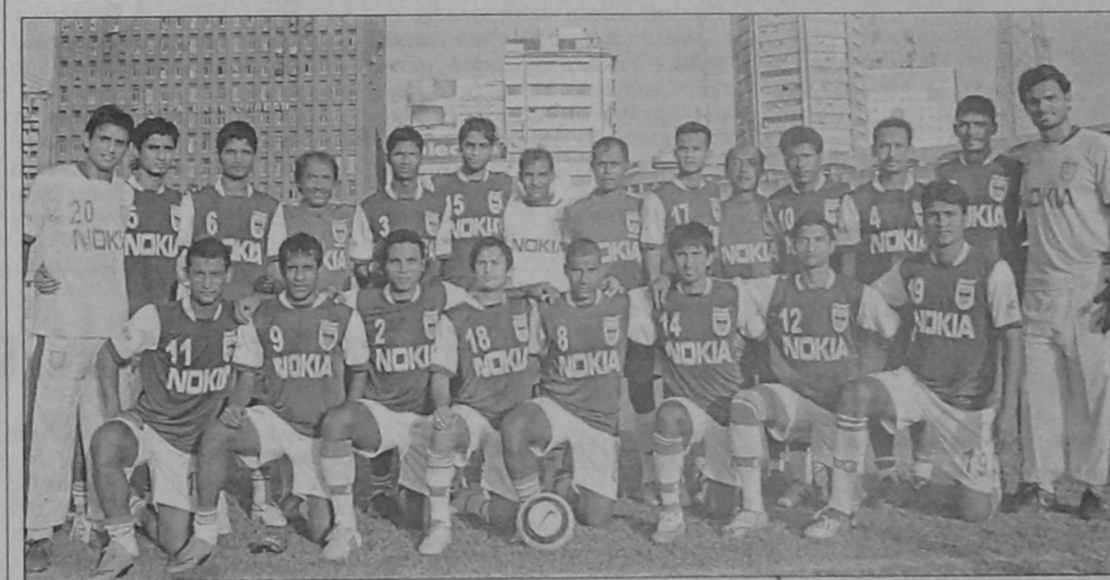
The Bangladesh football team pose for a photograph yesterday ahead of their departure to Myanmar last night.

Yet within a minute they should have reduced the deficit, Cristiano Ronaldo slotting wide from close range following a perfect lofted cross by Park. Rooney had a header saved soon after, and the visitors then introduced Ryan Giggs in place of Anderson with 18 minutes remaining in a bid to salvage something from the game. However, it was Arsenal who had the next opportunity, referee Howard Webb waving away penalty appeals as Nemanja Vidic tugged on the shirt of Nasri. Ferguson brought on Carlos Tevez in place of Rooney in a further bid to snatch an unlikely point and Arsenal were forced to take off Almunia, with Lukas Fabianski on after the Spanish keeper was injured in a challenge with Carrick. United teenager Rafael, on for Neville, gave United a glimmer of hope in the 90th minute when he chipped down a clearance on the edge of the area and volleyed left footed into the corner of Fabianski's net. But victory takes Arsenal into third place, and although Man United have a game in hand, this is a huge psychological boost for Wenger and his side.