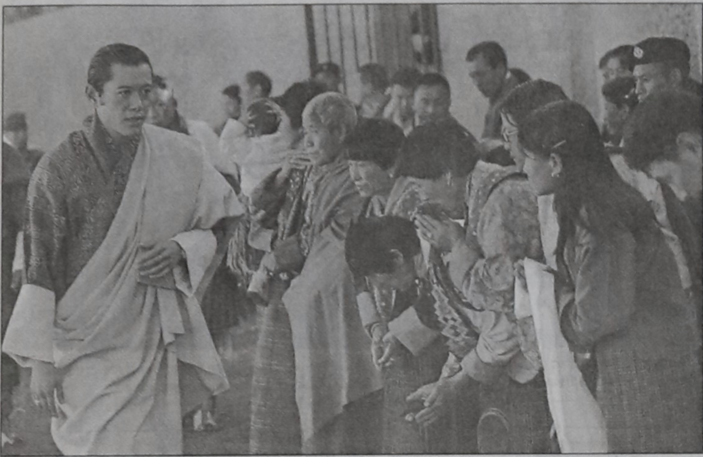
Bhutan's King, Jigme Khesar Namgyel Wangchuck, walks during a public ceremony in Thimphu yesterday. Bhutan's new king vowed to shield his remote and traditionally insular Himalayan nation from the negative forces of globalisation. In a speech the day after his lavish coronation ceremony, 28-year-old Jigme Khesar Namgyel Wangchuck said he would protect the landlocked country's unique culture and traditions by pursuing the principle of 'Gross National Happiness.'