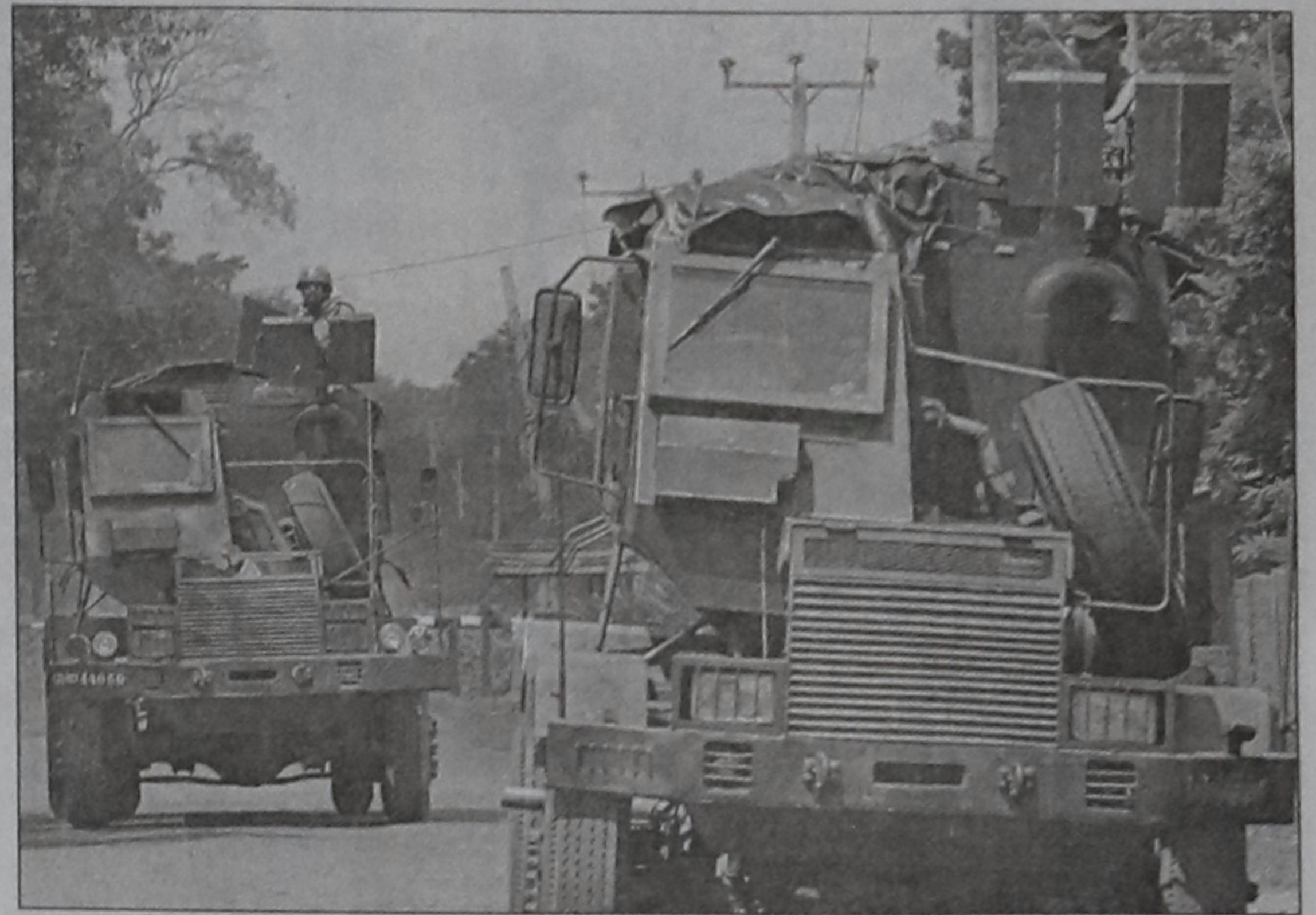
An armoured tank belonging to the Sri Lankan Army drives towards a Catholic church dedicated to the Virgin Mary in the war-hit northern town of Madhu yesterday. The Ave Maria church in Madhu is synonymous among Christians who account for seven per cent of Sri Lanka's 19 million population, for its alleged miraculous healing powers. Sri Lanka's military captured the church area in April after fierce battles with Tamil Tiger rebels.

The hike in defence budget accompanies an estimated budget deficit of over USD 3 billion or 6.5 per cent of the GDP.