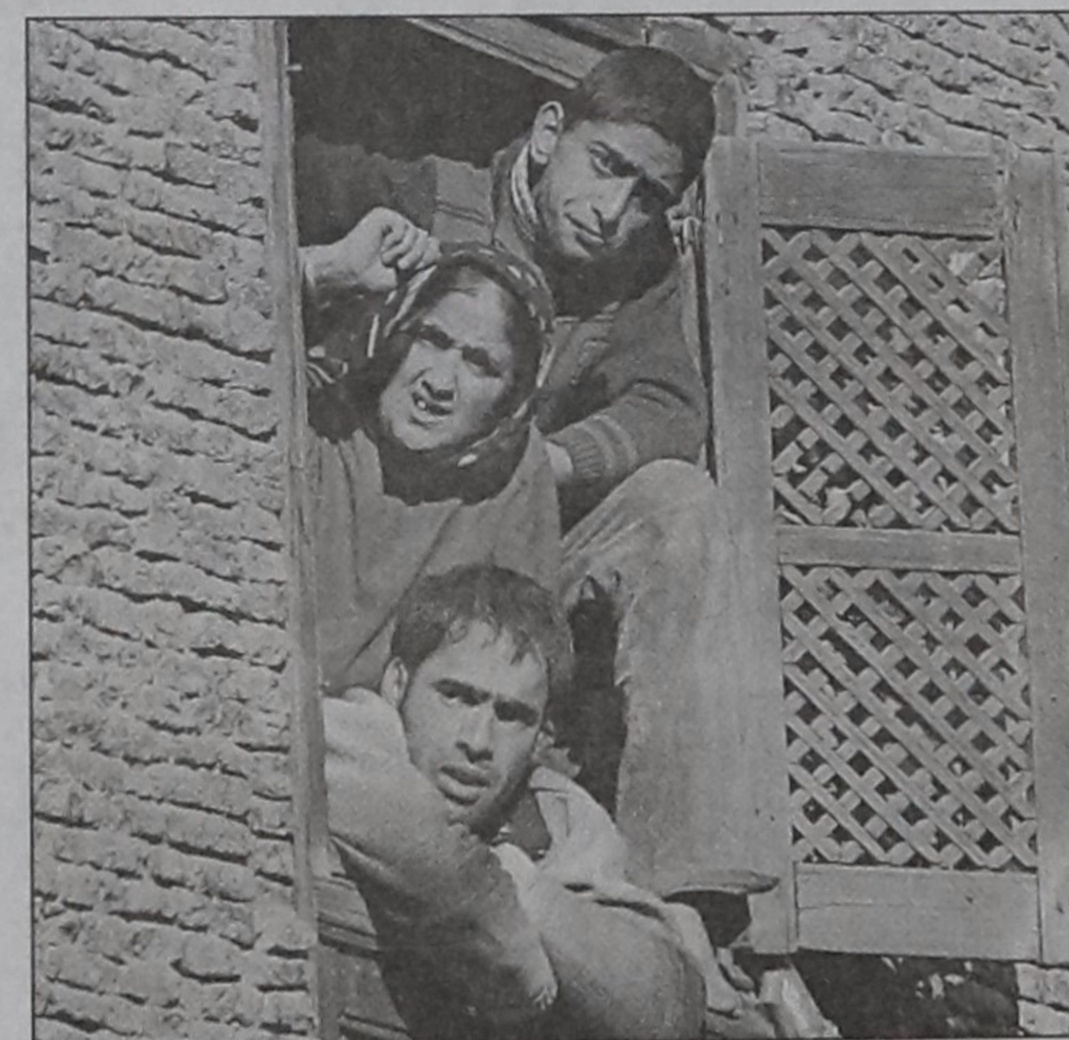
Kashmiri householders look from windows as unseen youths gesture towards security personnel in Srinagar yesterday. Thousands of troops were deployed in Indian-held Kashmir to prevent a protest rally called by separatist leaders against Indian rule in the Muslim-majority region.