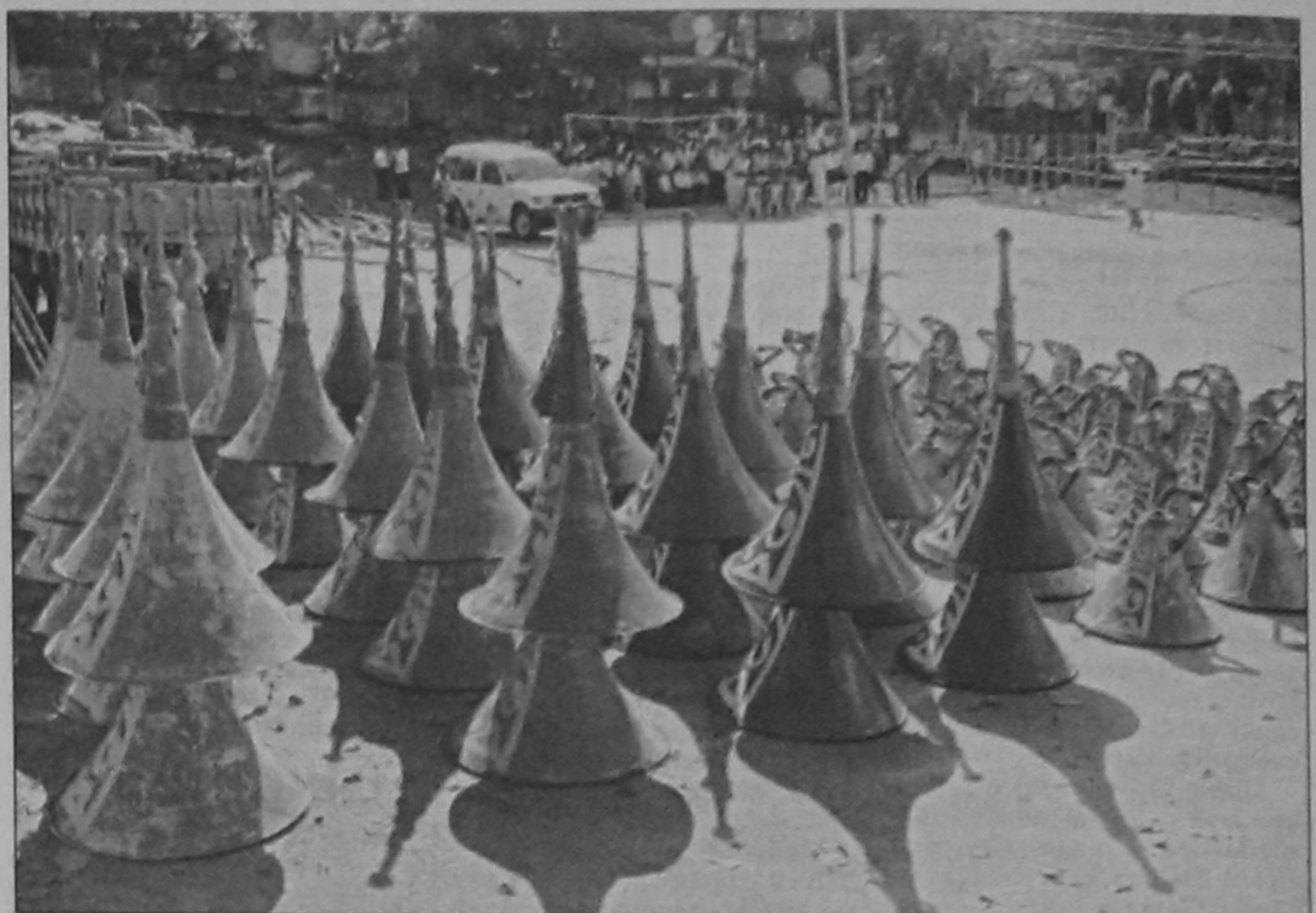
Horn-speakers are brought in for today's BNP rally at Laidighi Maidan in Chittagong. BNP Chairperson Khaleda Zia is scheduled to address the rally, the first since her release.