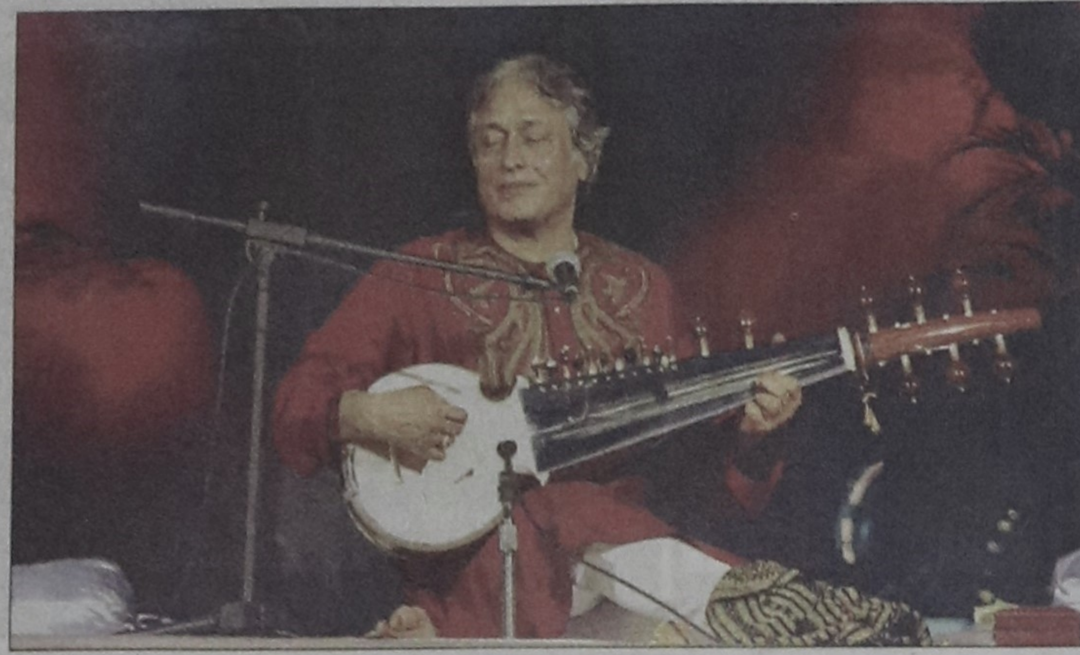
Sarod maestro Ustad Amjad Ali Khan plays 'Tribute to Bangladesh', the piece he composed in honour of Bangladesh and played for the first time at Dhaka Club last night. Amjad Ali, who belongs to the sixth generation of Senia Bangash School of music, gave a superb performance of five memorable classical compositions on the stringed instrument.

The speakers noted that highest number of accidents take place in Bangladesh.