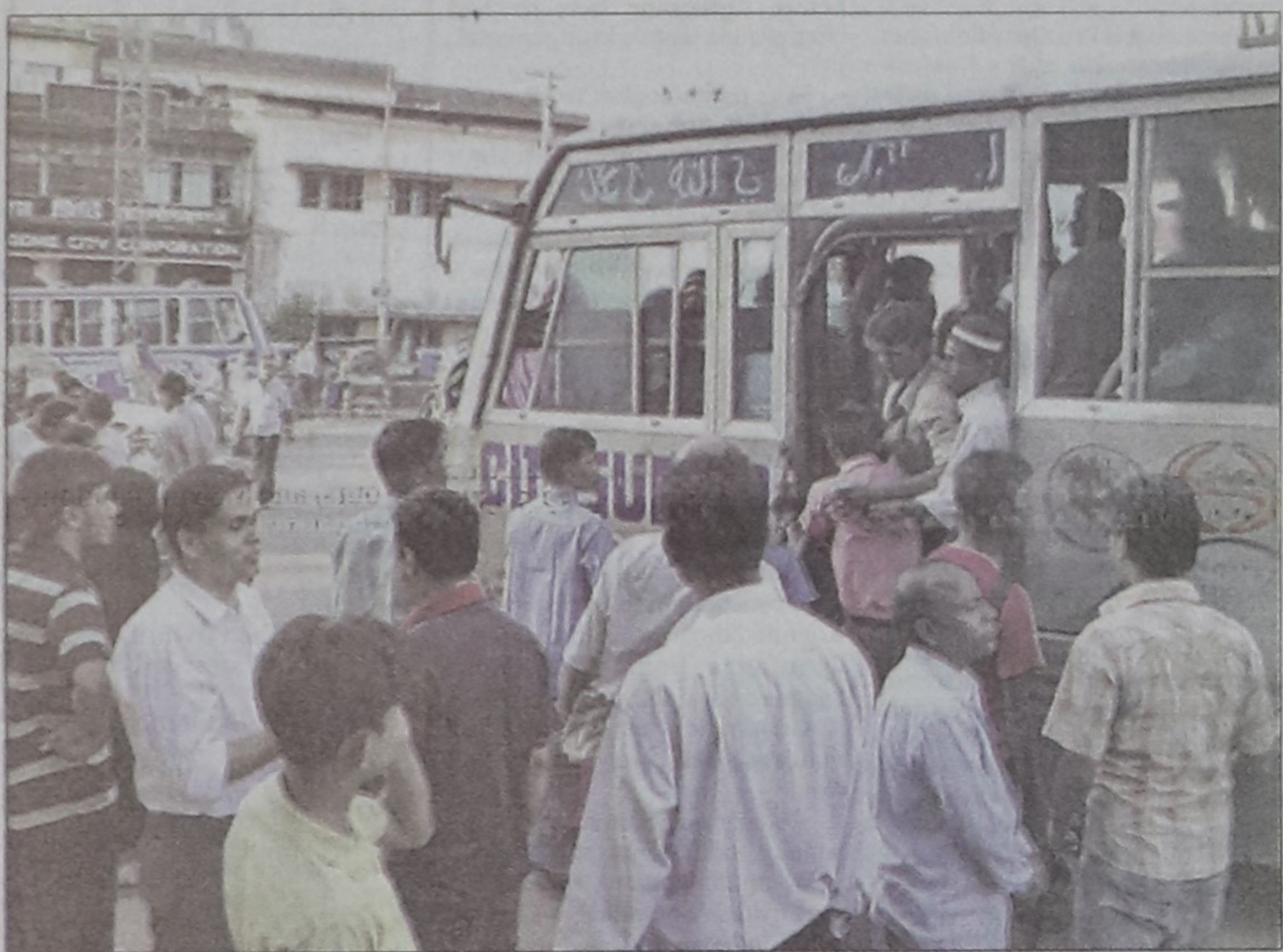
City service buses pick up passengers from any place at their will ignoring counter system and traffic rules.