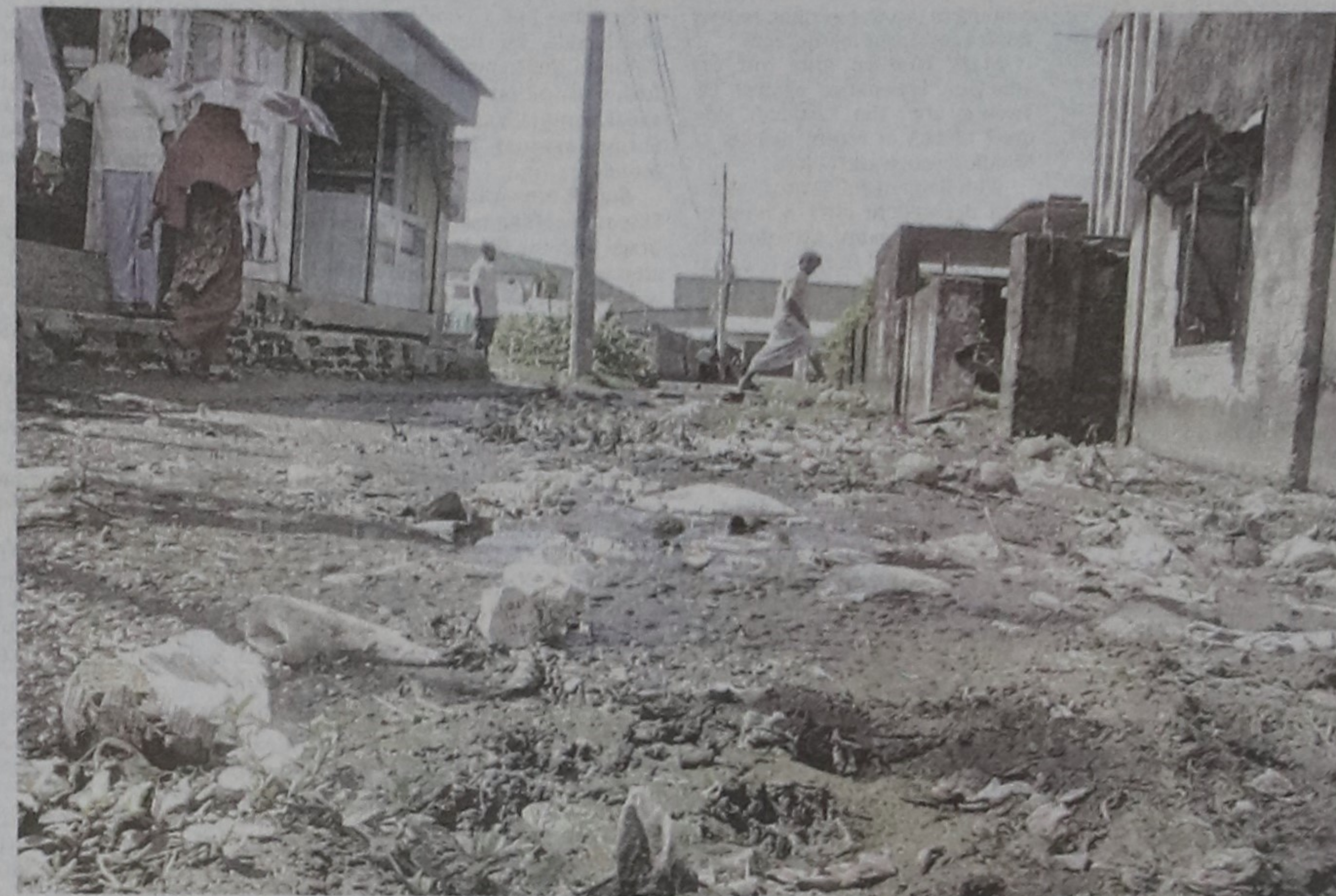
Dr Fazlul Hazara Women College Road in Kattali area remained dilapidated for long. Locals and students of the college suffer a lot while passing through the road that appears to have turned into a dustbin full of garbage. A renovation work was undertaken 10 months ago only to see the road lie with brickbats spreading on it till date. The photo was taken on Monday.

CDA took the initiative for the project responding to an appeal by BGMEA in this regard, he said, adding that alongside offering hygienic accommodation the dormitories near their workplace will also help the female workers of CEPZ to save transportation cost.