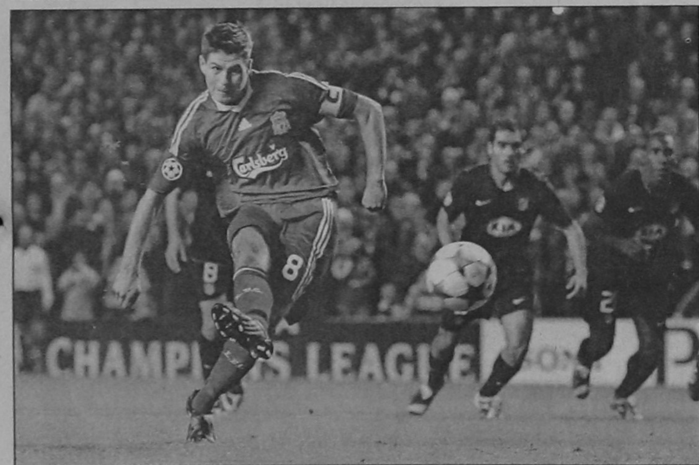
Liverpool star Steven Gerrard (L) scores the equalising goal from a penalty during their Champions League clash against Atletico Madrid at Anfield on Tuesday.

The partisan crowd was ecstatic six minutes later when Diego won the ball and set free Lucas who then released Endo down the left with acres of space.