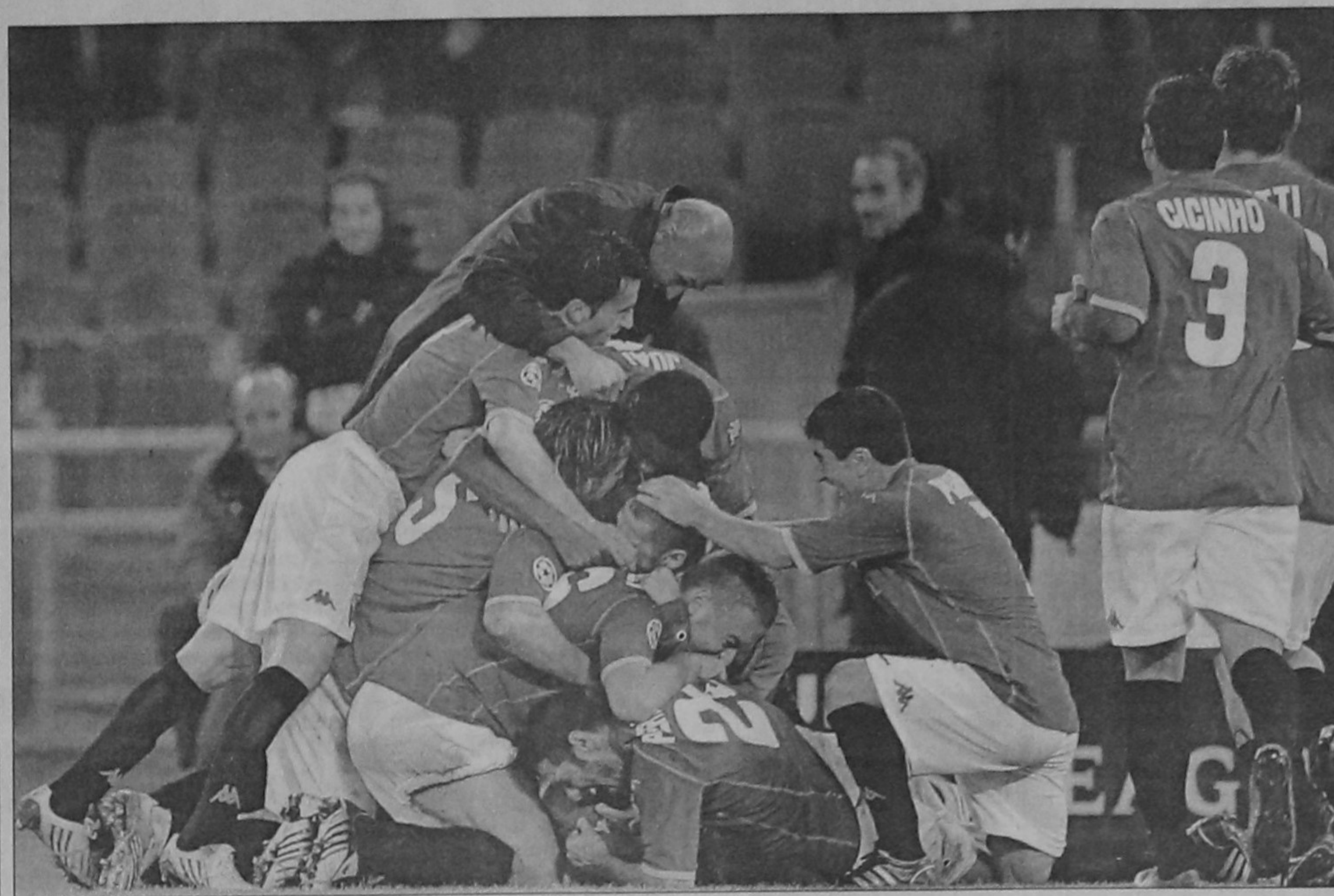
Roma players celebrate with coach Luciano Spalletti (top) after forward Mirko Vucinic scored against Chelsea during their Champions League encounter at the Olympic Stadium in Rome on Tuesday.

"The charge relates to his conduct towards referee Martin Atkinson in the tunnel at half-time of Sunderland's match against Chelsea on Saturday, 1 November. Keane has until 19 November to respond to the charge."