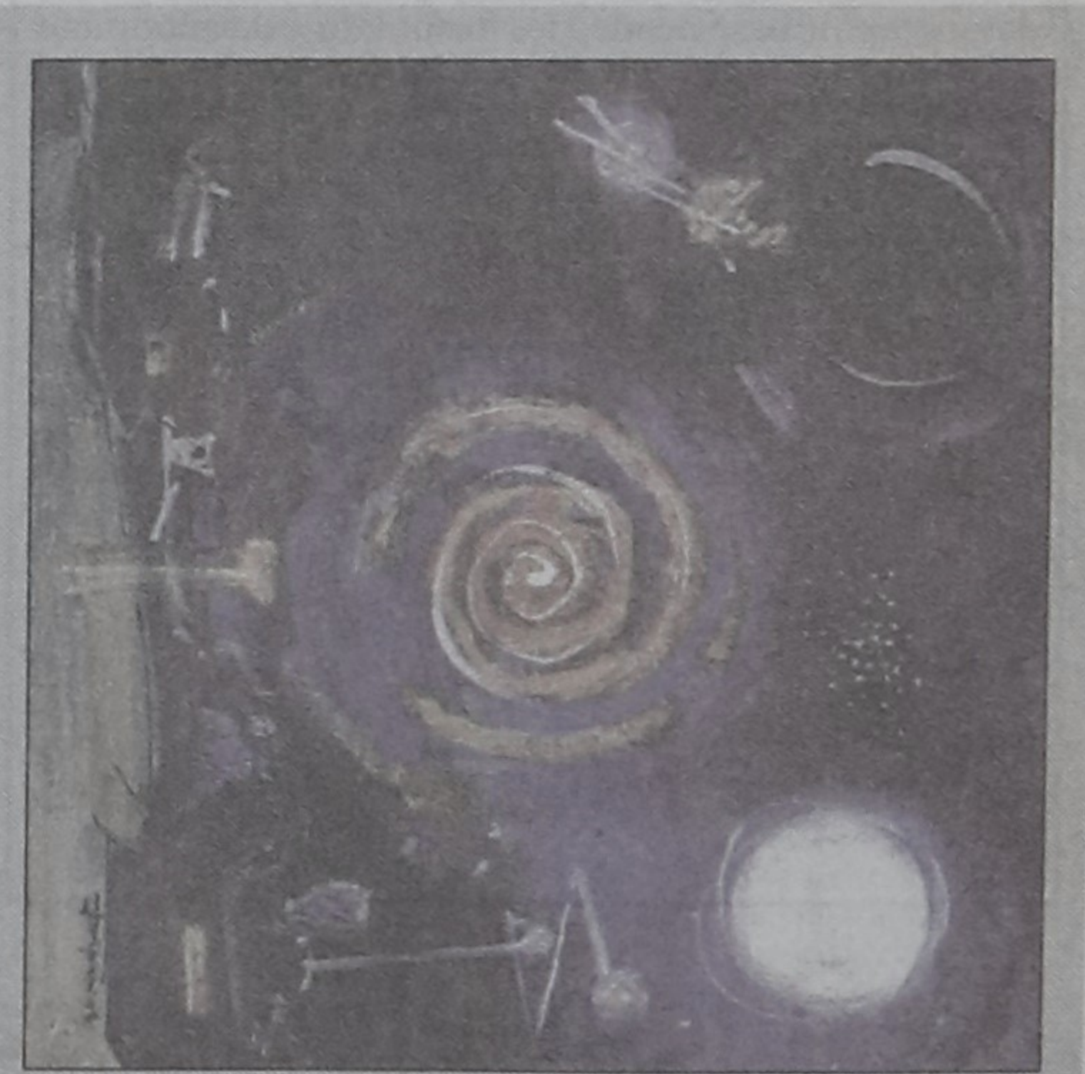
(Clockwise from top-left): "Nakshi Katha," oil on canvas; "Seen beyond Sight," acrylic; "Unacceptable," mixed media on paper.