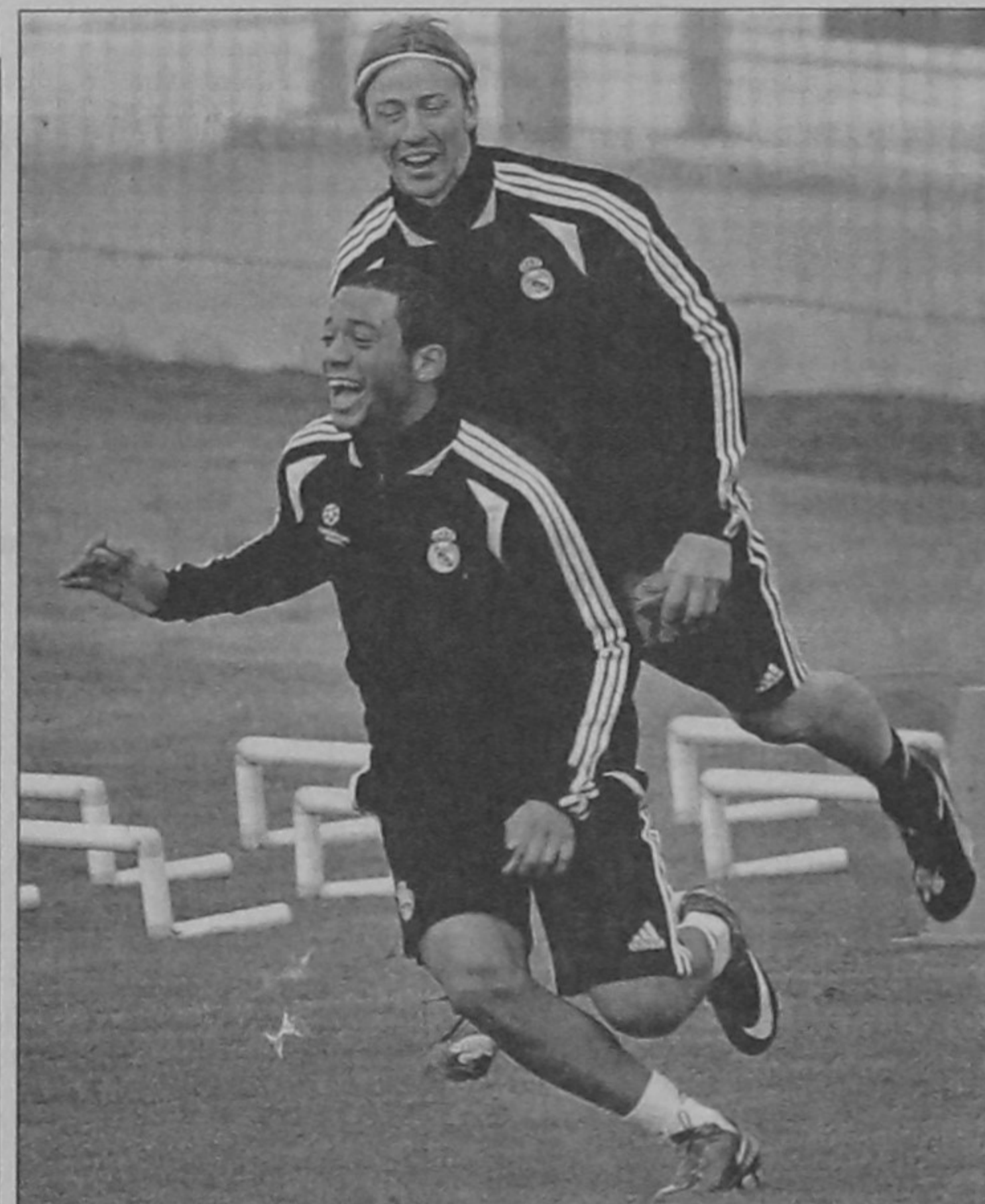
Real Madrid defender Marcelo (L) and midfielder Guti have fun during a training session on the eve of their Champions League match against Juventus in Madrid on Tuesday.

In May 2003, Juventus scored a memorable 3-1 win over Real to reach the final against compatriots AC Milan, with goals from Del Piero, David Trezeguet and Pavel Nedved.