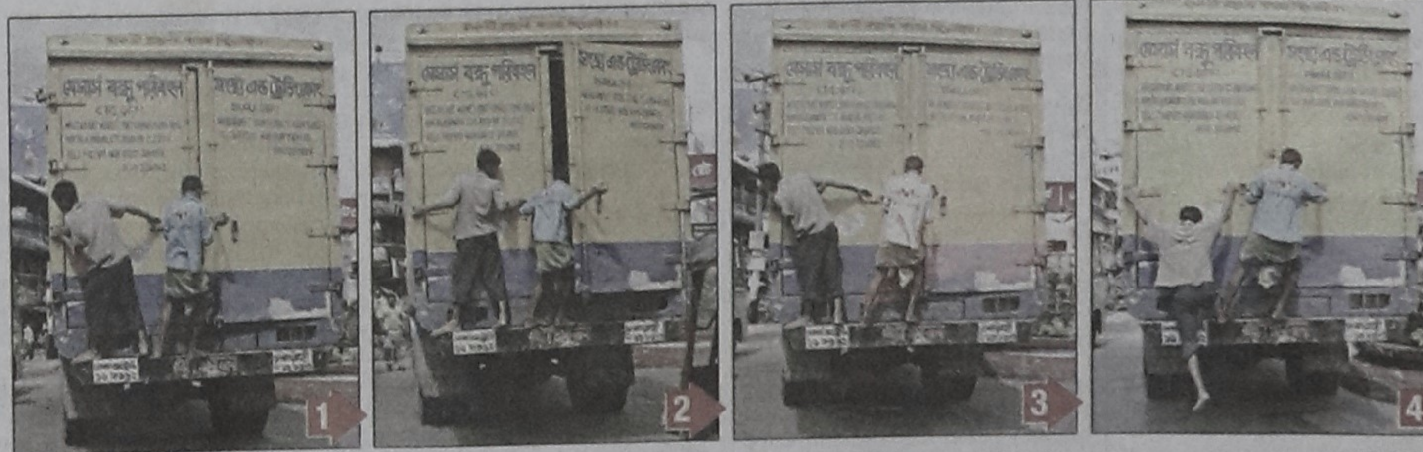
1. Two thieves climb on the back of a moving covered van near EPZ Gate in Chittagong yesterday. One of them picks the lock of the van door while the other keeps watch. 2. They open the door. 3. Finding the van empty they lock the door. 4. They get off the van.