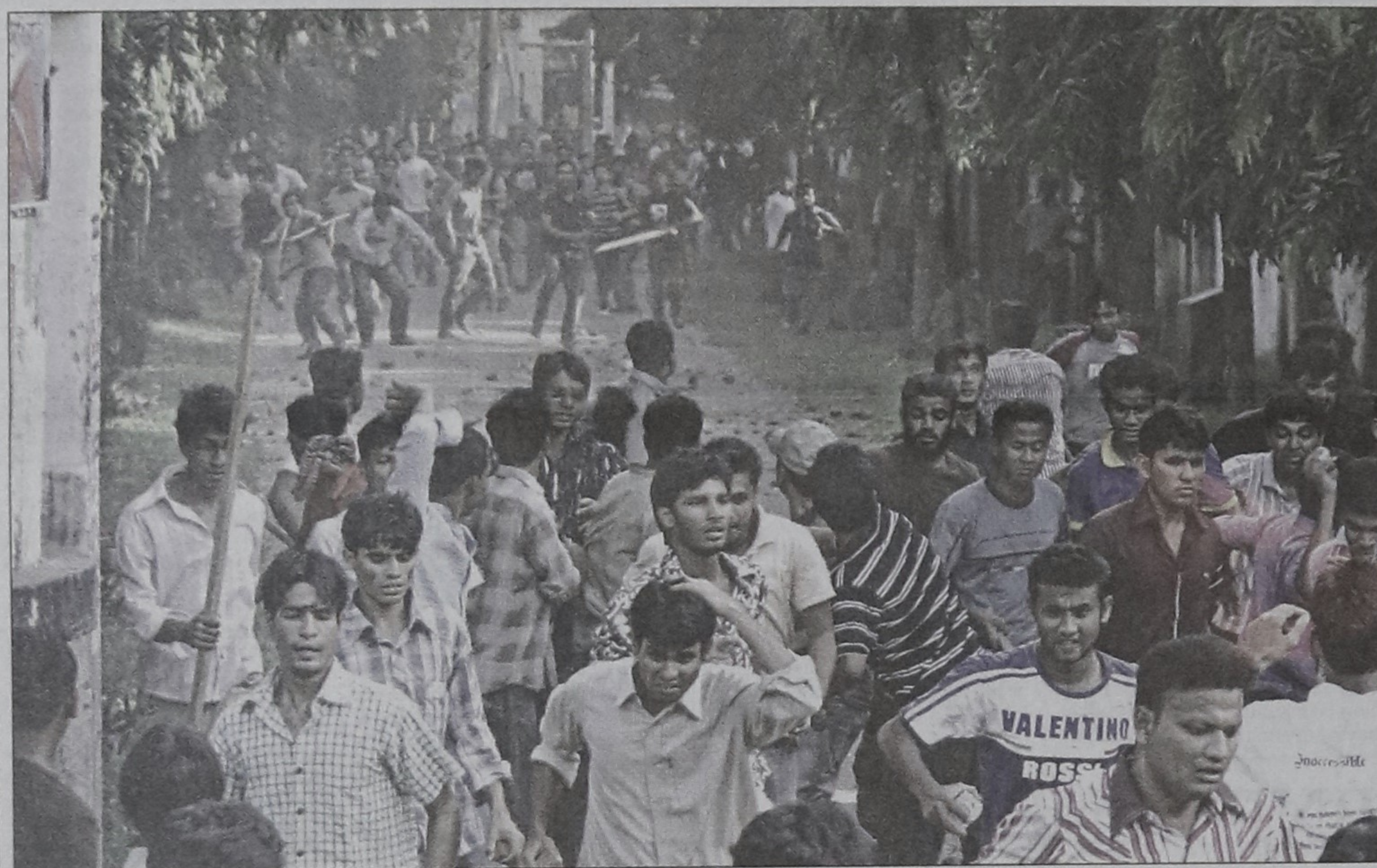
Students of Jahurul Haq Hall of Dhaka University chase students of F Rahman Hall during a clash on campus yesterday.