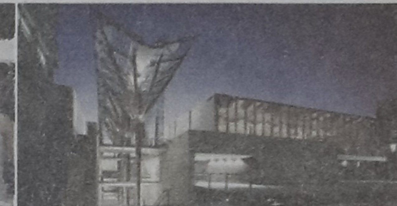
John Niland Scientia Building at UNSW

The University of New South Wales is one of the leading universities in Australia, consistently achieving 5 star ratings on key performance indicators such as graduate starting salaries in the 2009 Australian Good Universities Guide.