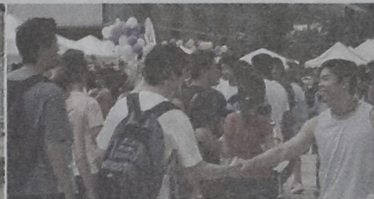
Orientation week at UNSW