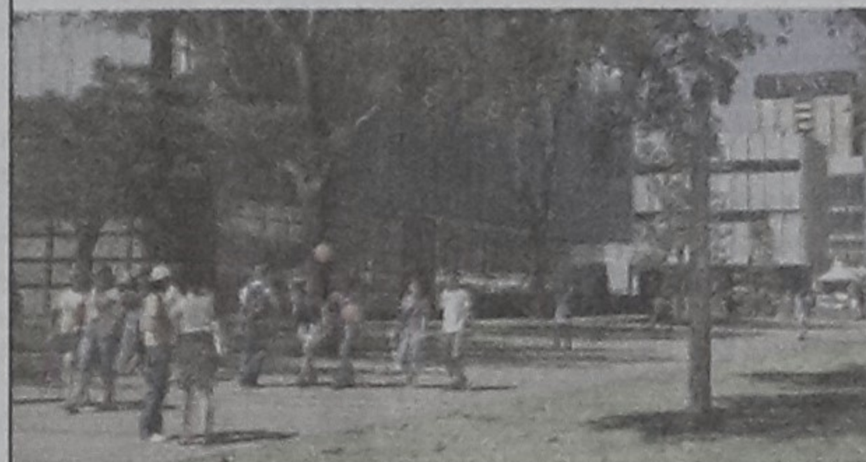
Students in front of the new Analytical Centre