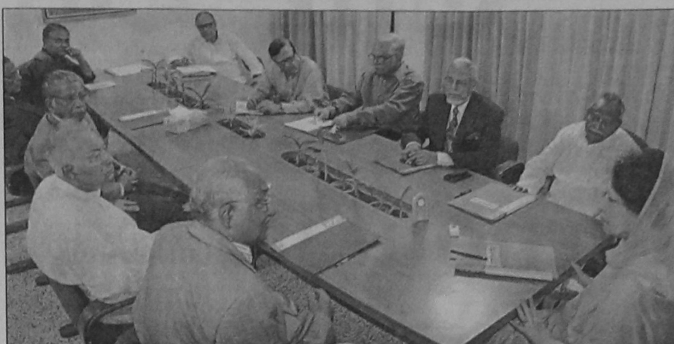
BNP Chairperson Khaleda Zia presides over the standing committee meeting of the party at her office at Gulshan in the city yesterday. (Story on Page 1)

Relatives and admirers are requested to attend the programme.