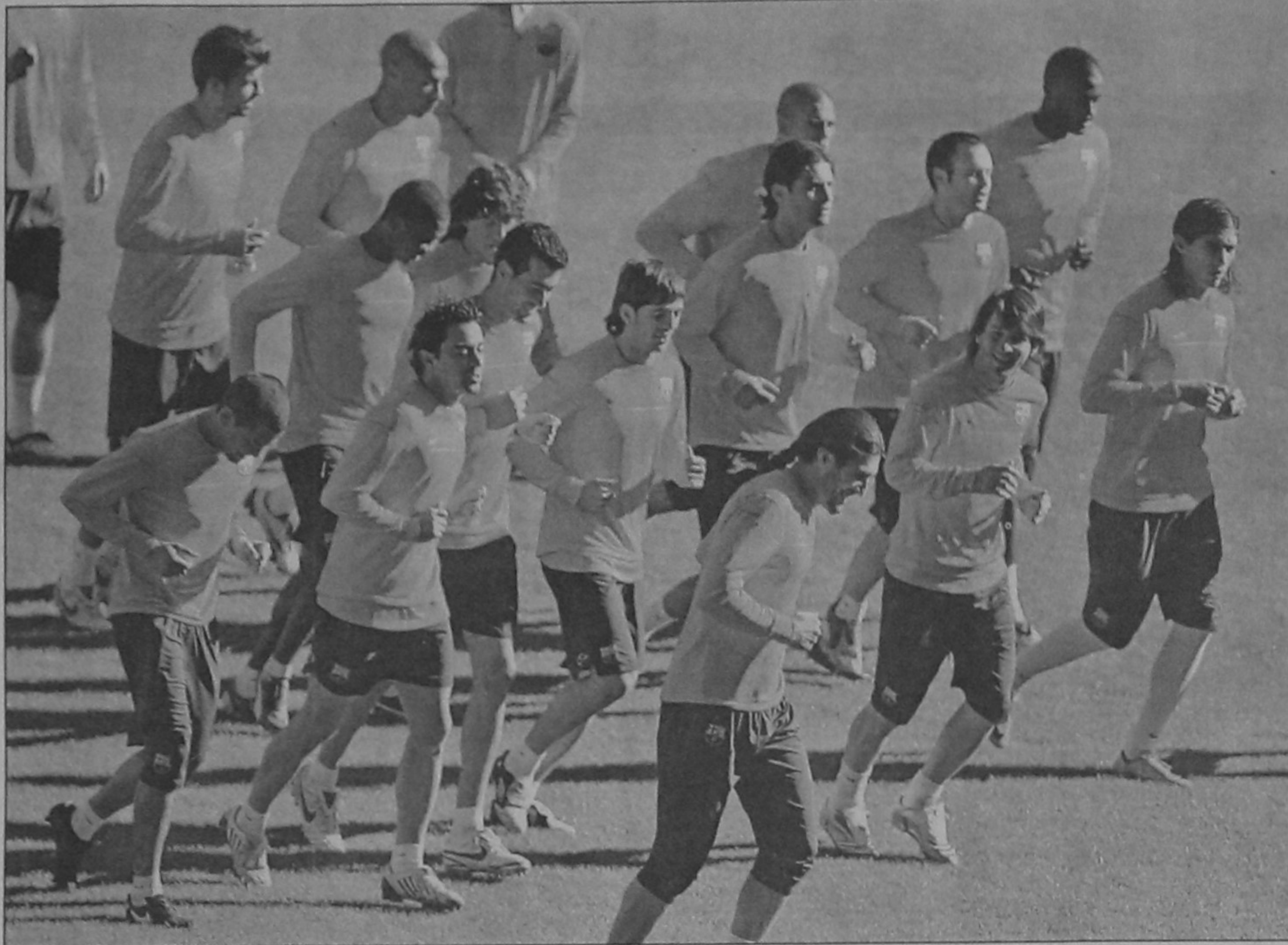
Barcelona players jog during a training session at Nou Camp on Monday on the eve of their Champions League match against Basel.