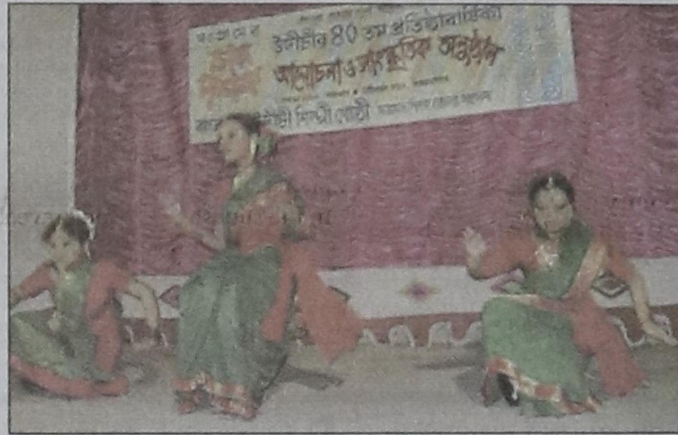
Artists of Udichi during a dance performance.

Udichi, a leading cultural organisation in the country, has been committed to the masses for the last 40 years, despite several attacks on its activities and members.