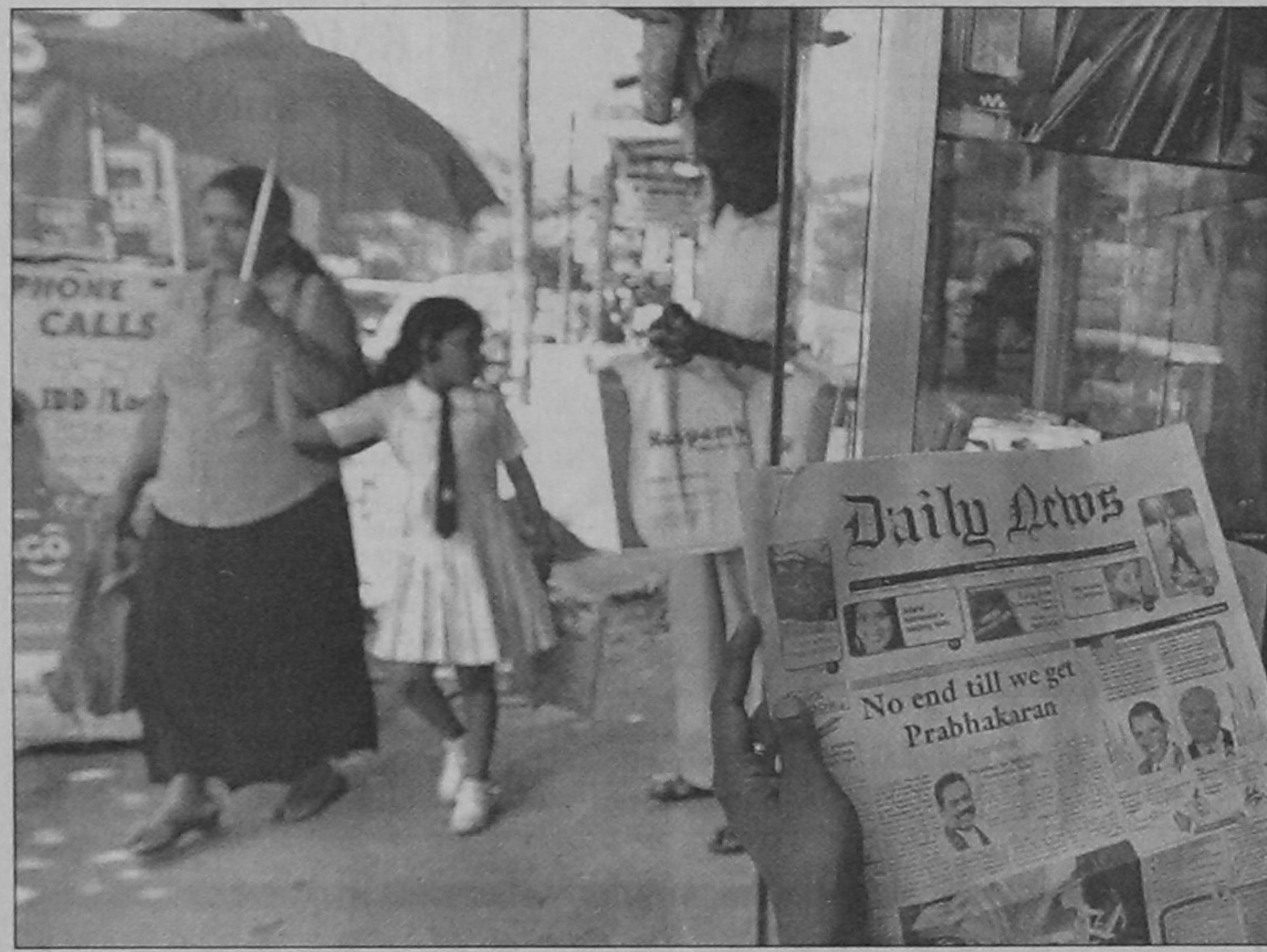
A Sri Lankan reader looks at the state-run Daily News, which reports that the government will take a tough line against Tamil Tiger rebels in Colombo yesterday. Government forces are on a major offensive to dislodge the rebels from their northern stronghold of Kilinochchi.