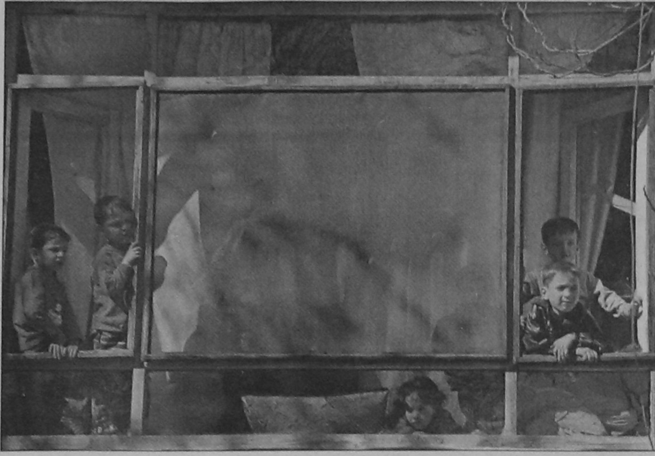
Afghan children look at the place where a Western aid worker was kidnapped yesterday. Unidentified gunmen abducted a Western aid worker in a street in the Afghan capital and shot dead an Afghan who tried to rescue him, the government said.