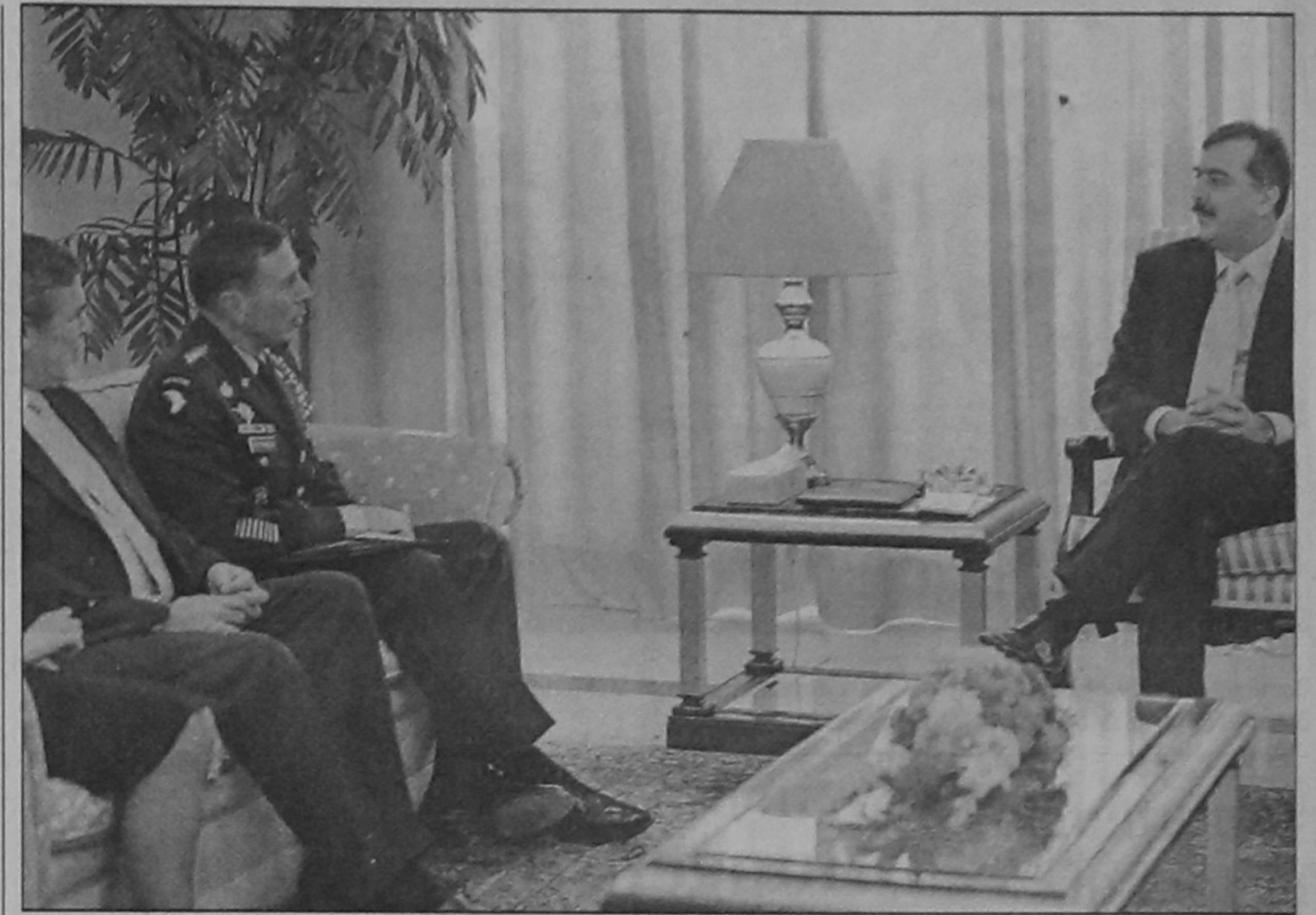
Pakistani Prime Minister Yousuf Raza Gilani (R) speaks to the new commander of US forces in the Middle East and Central Asia General David Petraeus (2nd L) and US Assistant Secretary of State Richard Boucher (L) during their meeting at the Prime Minister's House in Islamabad yesterday. Pakistan voiced fears that further US missile strikes inside its territory could spark a violent backlash and severely hamper efforts to curb extremism.

The Indian-American community, however, reacted angrily, urging Mr Obama to focus on domestic issues.