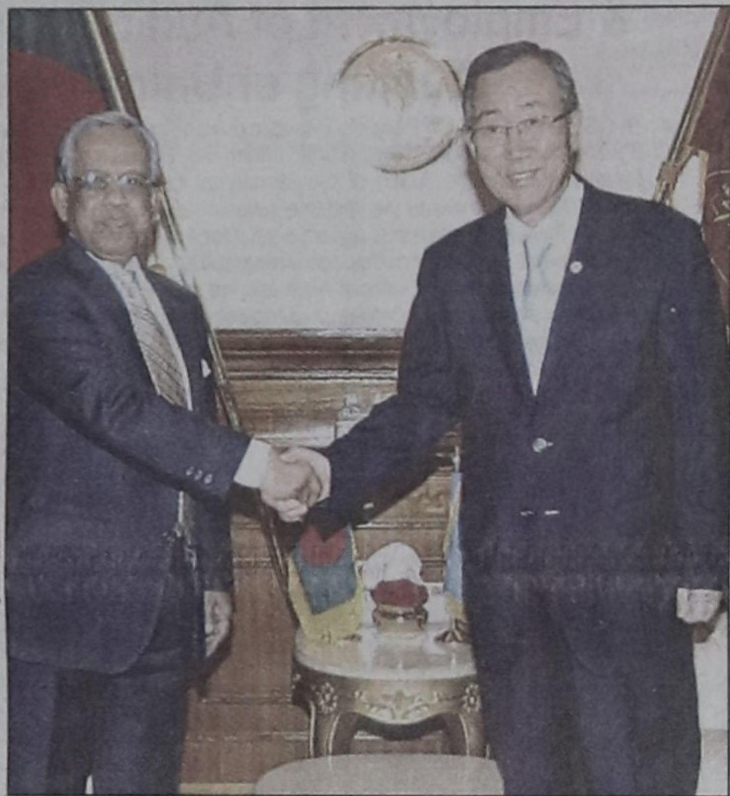
United Nations Secretary General Ban Ki-moon meets Chief Adviser Fakhruddin Ahmed at the latter's office in the city yesterday.

Ki-moon, however, struck a note of caution so the government