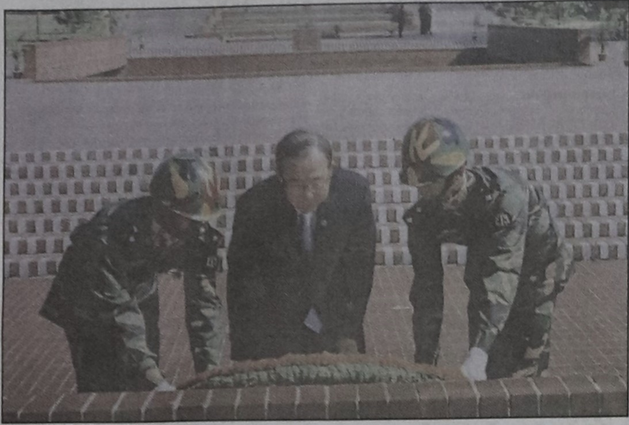
United Nations Secretary General Ban Ki-moon places a wreath at the National Mausoleum at Savar yesterday to pay his respects to the liberation war martyrs.