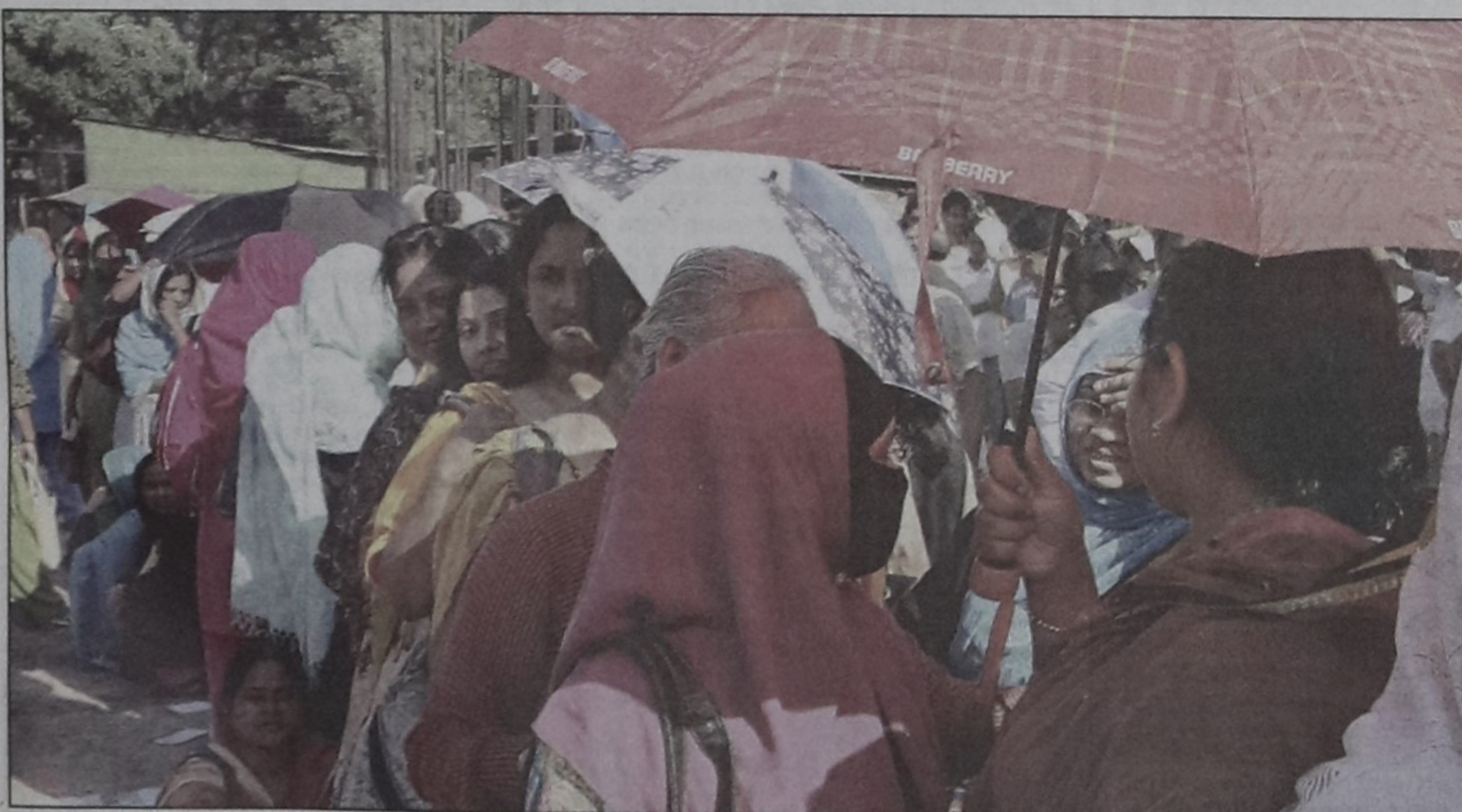
Guardians stand in long queues on the Vigarunnisa Noon School and College premises in the city yesterday to collect the admission test forms of class one (Bangla medium) for their wards.

According to the experts, three out of every 10,000 people across the world get affected with Sick Sinus Syndrome while the rate of heart failure has been increasing day by day and more than 550,000 new cases of heart failure is diagnosed in the United States each year.