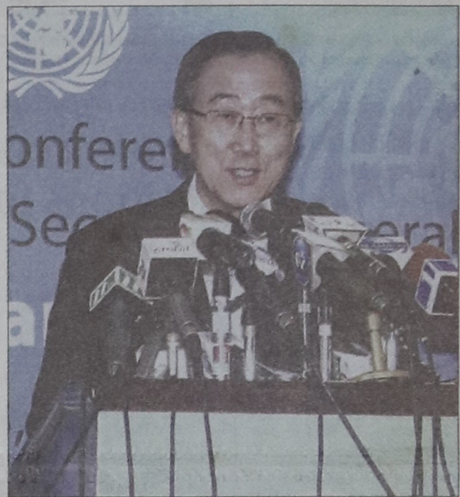
UN Secretary-General Ban Ki-moon speaks to the press at Hotel Sonargaon in the capital before leaving for Dubai concluding his tour in Bangladesh.