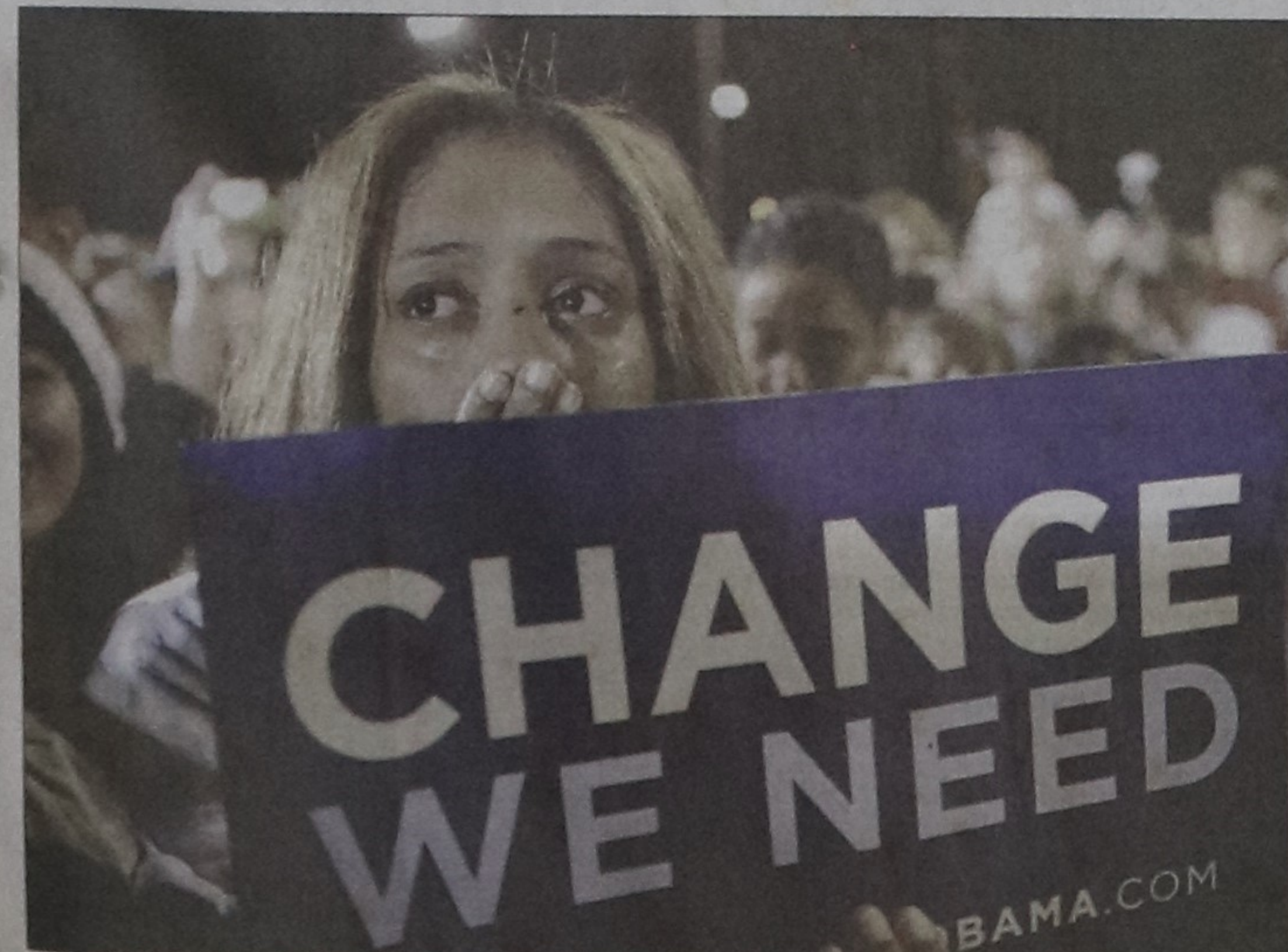
Moved by the powerful speech of Democratic presidential candidate Senator Barack Obama, one of his supporters cries during a rally at JFK Stadium in Springfield, Missouri Saturday.