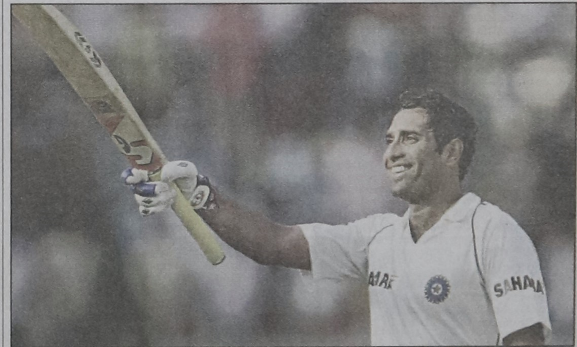
HI THERE: India batsman VVS Laxman acknowledges the crowd's applause on reaching his double century in the first innings on the second day of the third Test against Australia at the Feroz Shah Kotla Stadium in New Delhi yesterday.