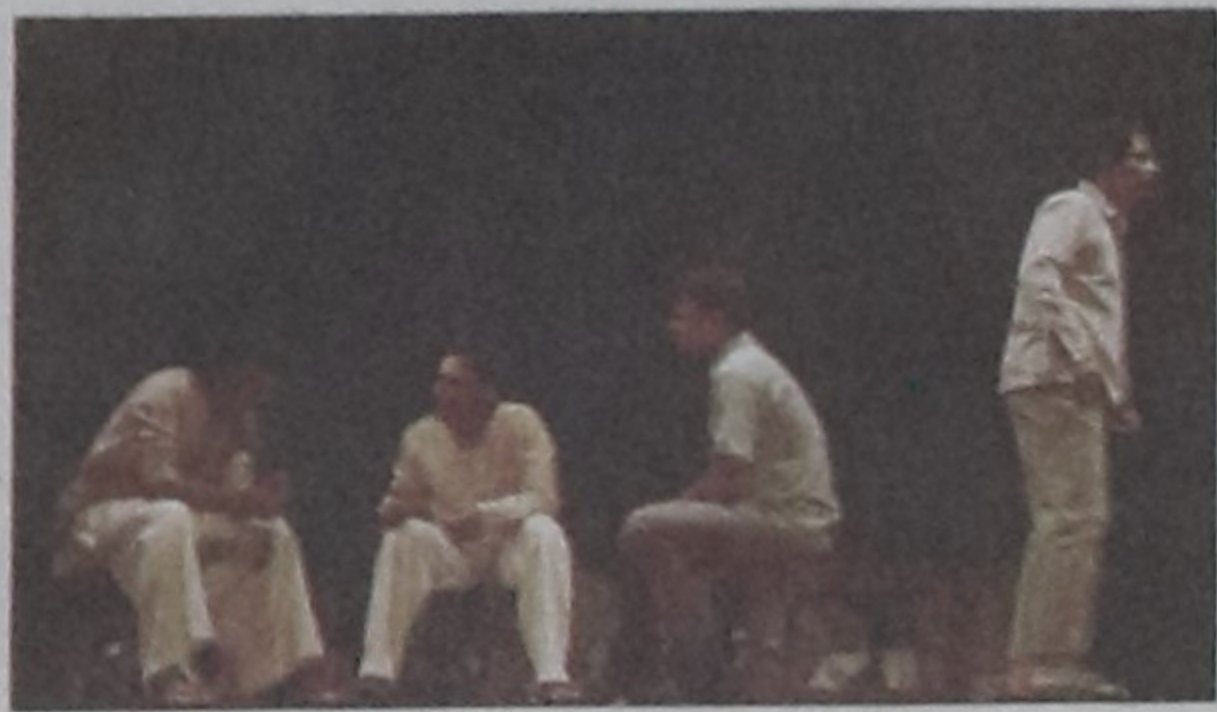
A scene from 'Abiram Jatra'.

Vow to fight aggression on cultural activities