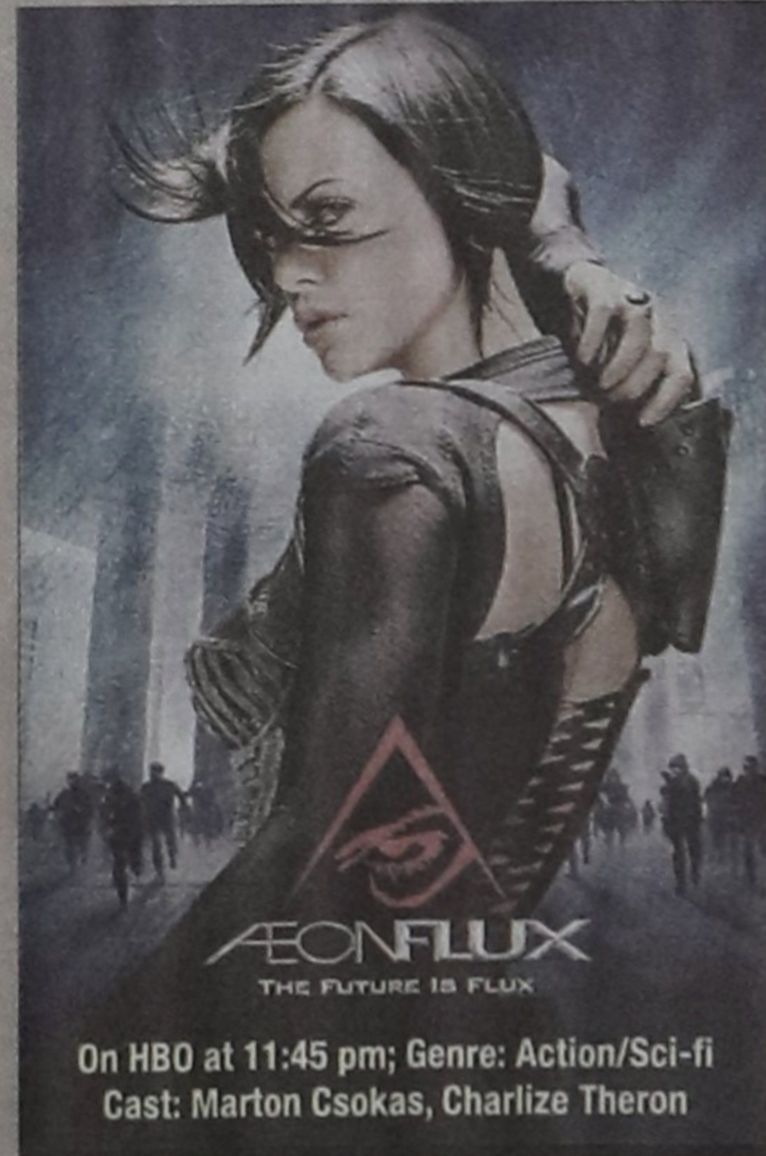
On HBO at 11:45 pm; Genre: Action/Sci-fi Cast: Marton Csokas, Charlize Theron

08:30 Hello Love 09:00 Drama: Shomporko 11:30 Bomey Bomey Rochito HBO 11:00 Look Who's Talking Too 12:30 The Tailor Of Panama