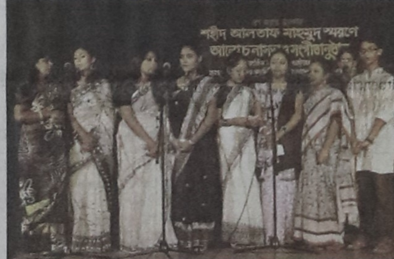
Students sing at the event.

Altaf Mahmud was awarded the Ekushey Padak (posthumous) in 1977.