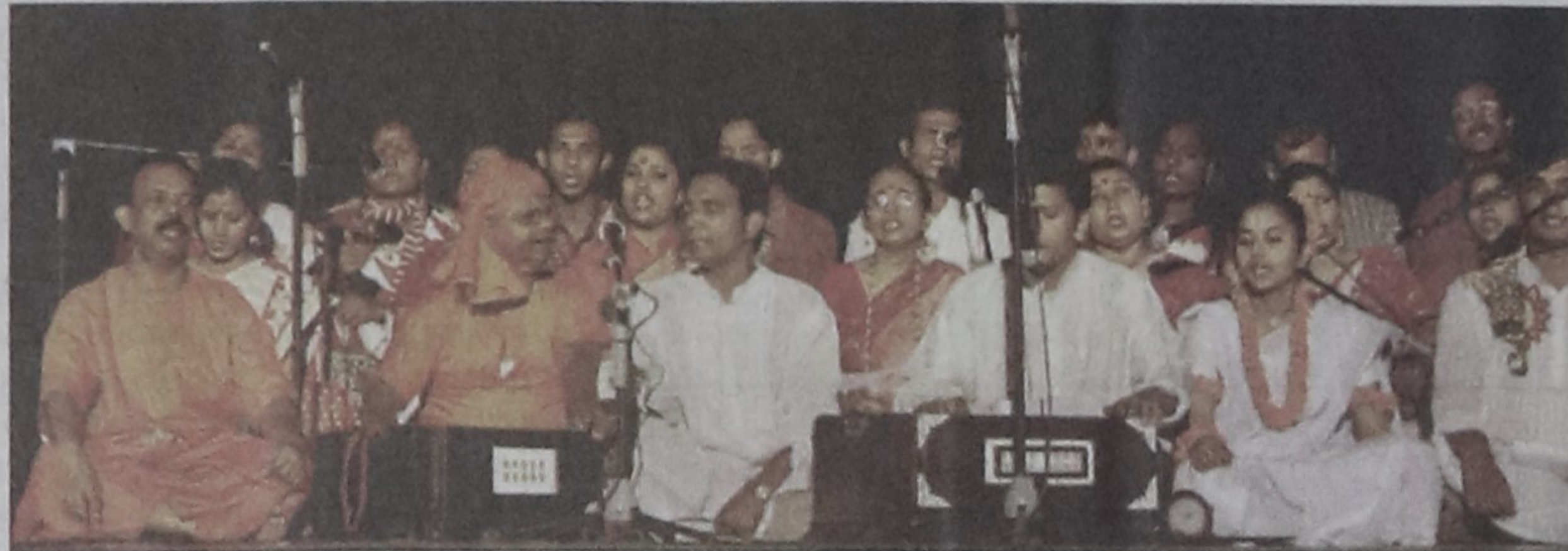
Artists of Udichi perform at the programme.