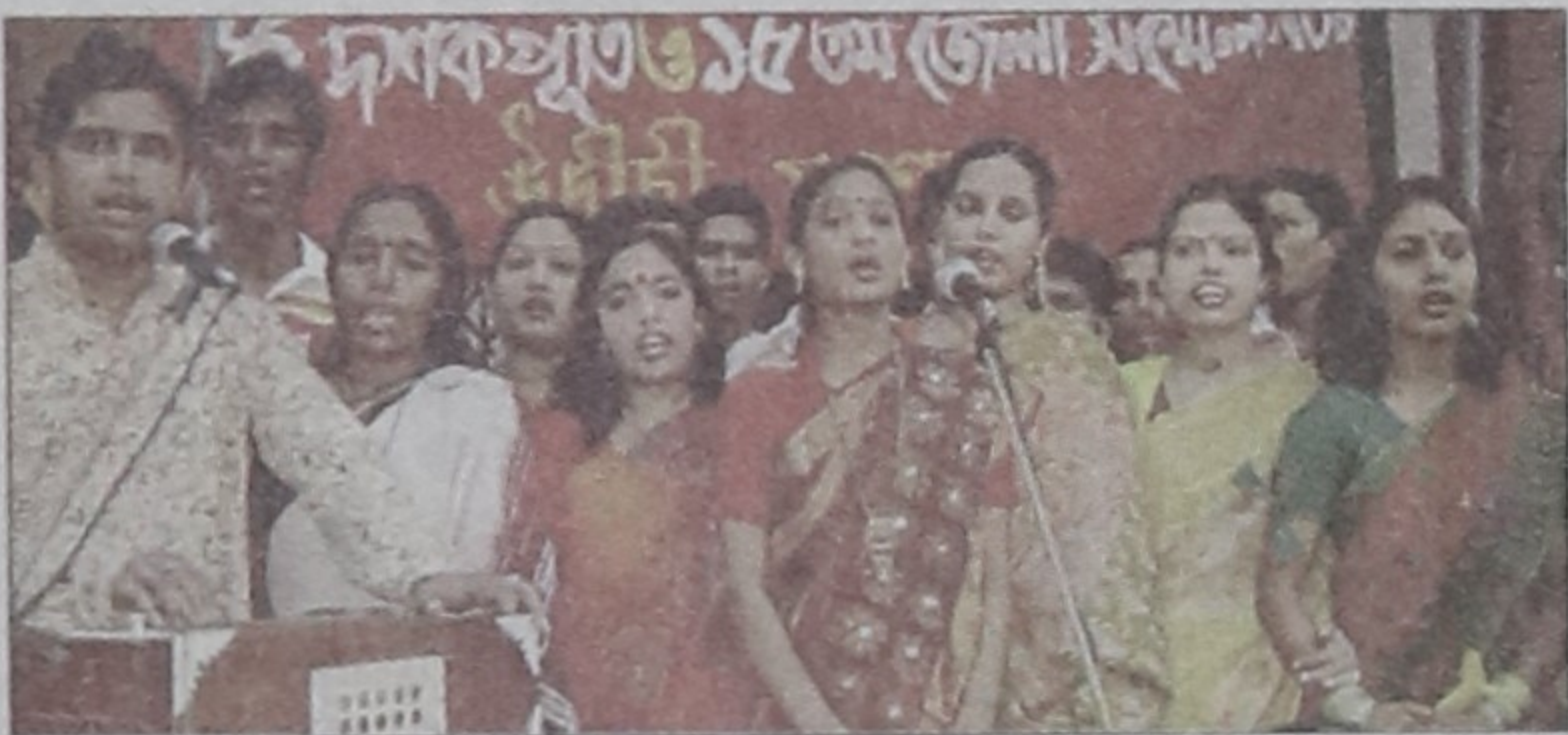
Artists of Jessore Udichi perform at the anniversary programme.

Today Khirna Udichi will stage "Chauvasta," Chuadanga Darshana Anirban Theater will stage "Bee," Jessore Hallabai will stage "Shekor," and Jessore Udichi will stage "Jodi Amra Shobai."