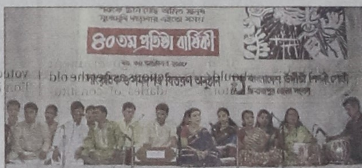
Performance by the artists of Udichi's Dinajpur Branch.

They also criticised Dinajpur Deputy Commissioner's stance as he declined to let Dinajpur Udichi bring out a procession on its anniversary. Speakers also urged the caretaker government to restore the "baul sculpture" in front of the Zia International Airport.