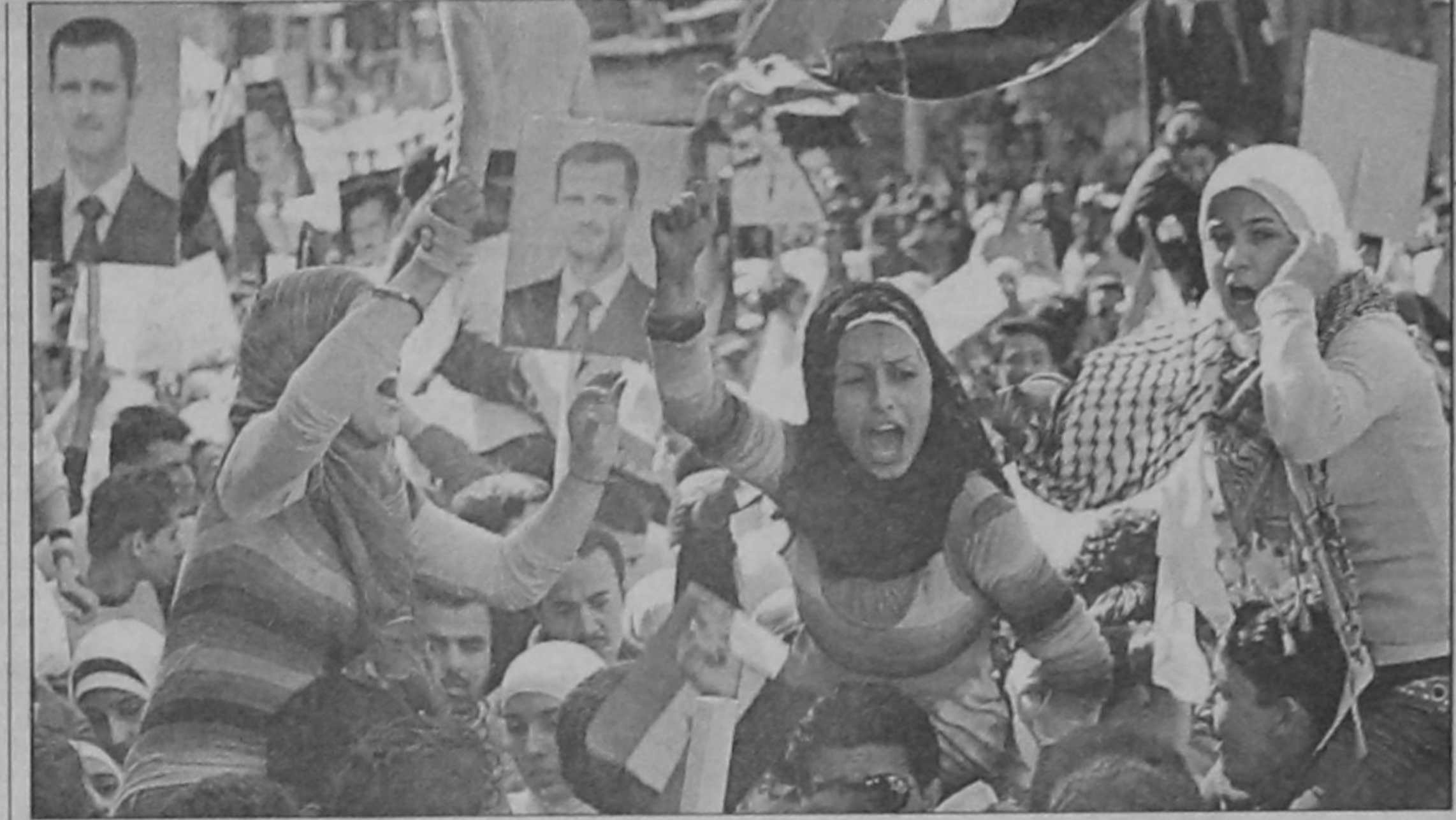
A Syrian woman shouts slogans as another holds a portrait of Syrian President Bashar al-Assad during a demonstration in Damascus yesterday to protest a deadly US raid that targeted a Syrian village near the Iraqi border on October 26.

UN forces had blocked tens of thousands of people displaced by the fighting from entering Goma, a French aid group said Thursday.