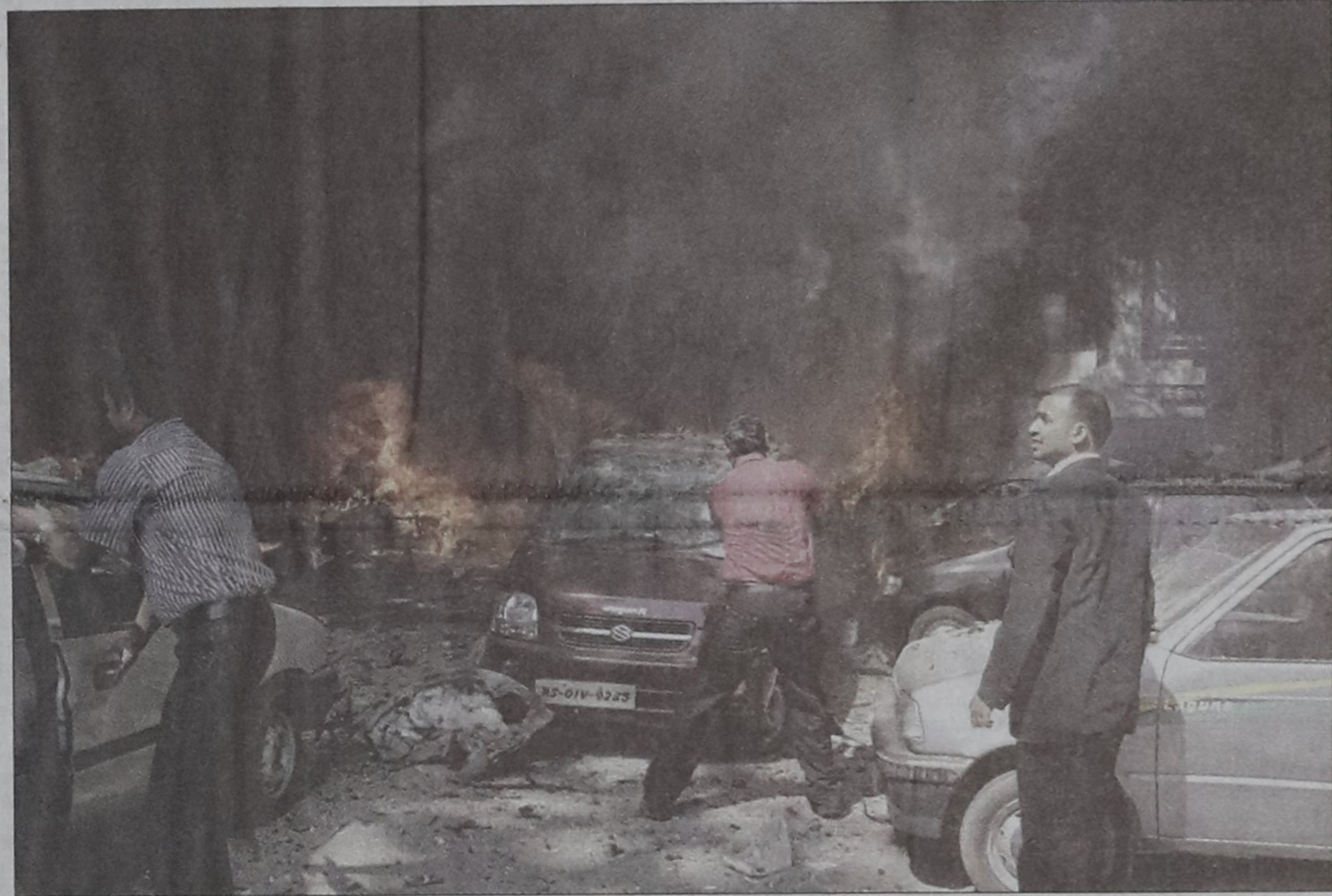
Vehicles burn after powerful bombs exploded near the District Court of Guwahati yesterday. The series of blasts ripped through the north-eastern Indian state of Assam killing at least 61.