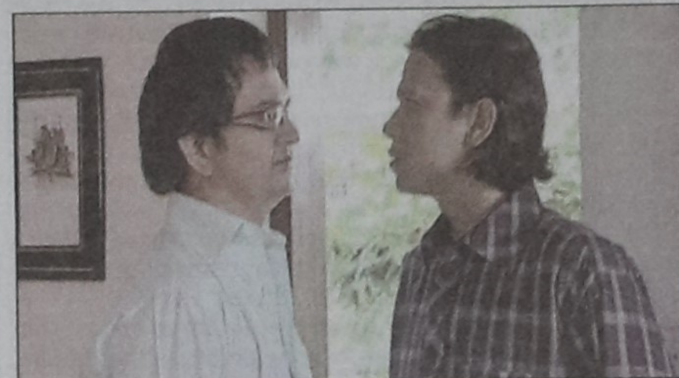
A scene from "Brishtir Jonyo."