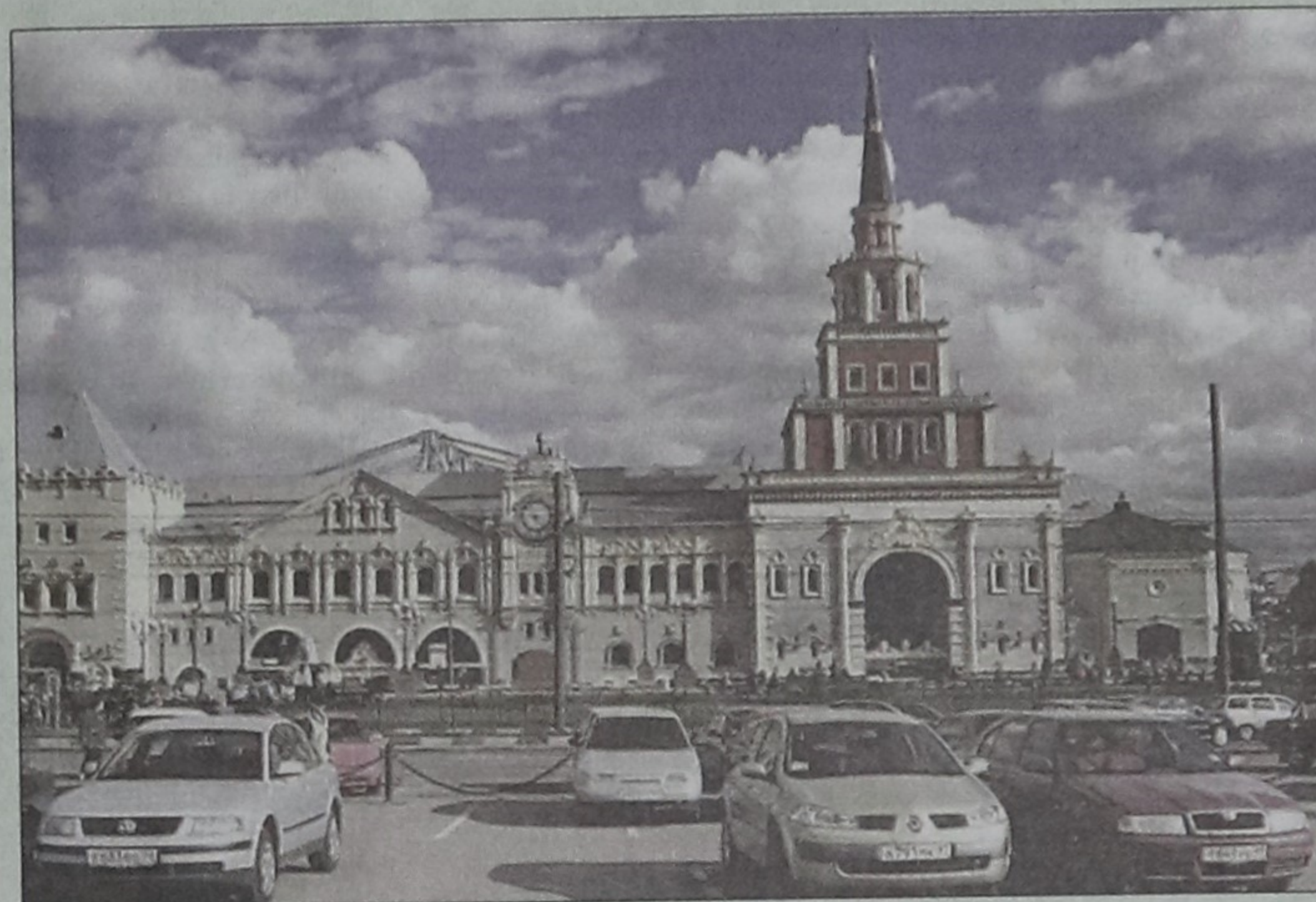
Front view of the Kazan Railway Terminal (design by Alexei Schusev) in Moscow.