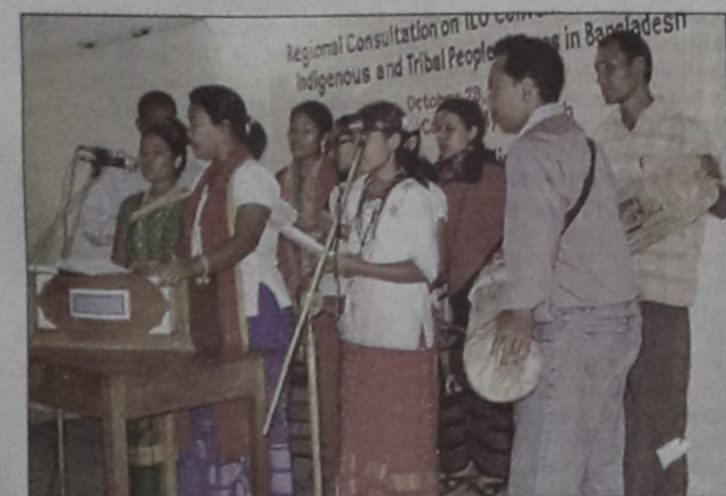
Artistes of Askipara Garo Cultural Group perform at the programme.