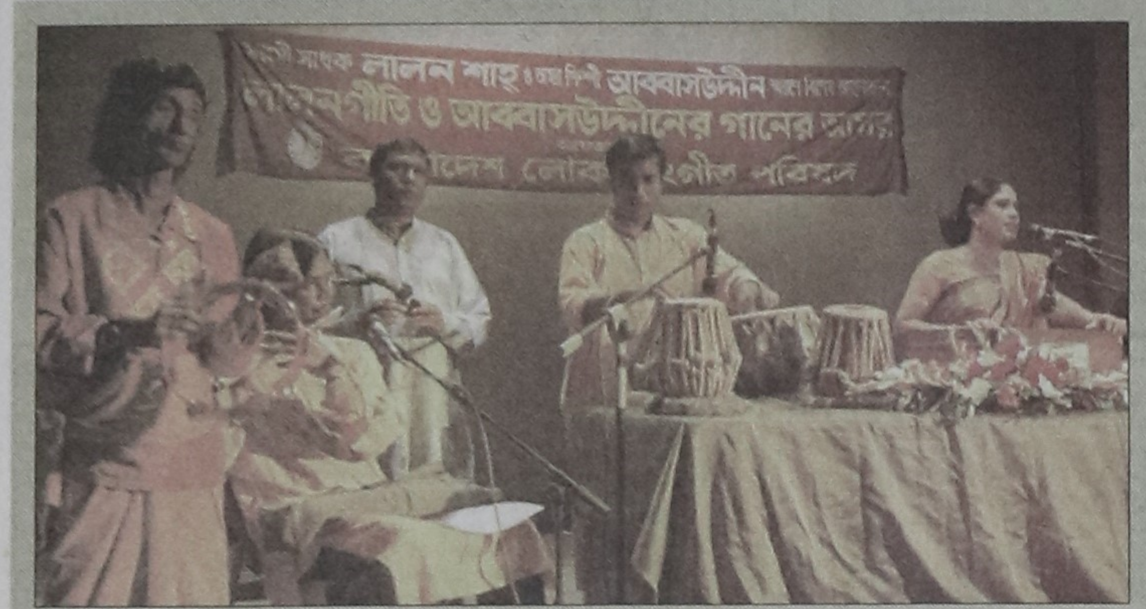
The musical soiree featured performances by folk artistes and musicians.