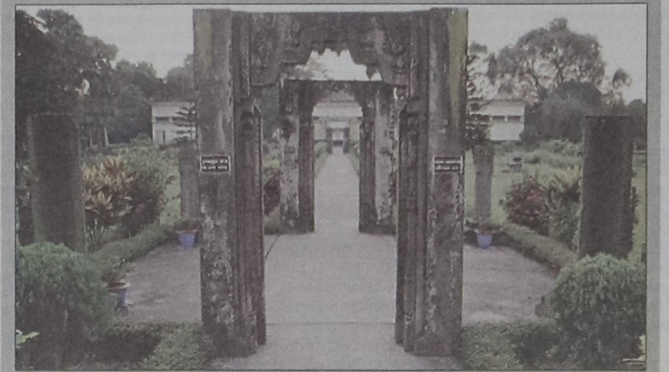
Clockwise (from top-left) A 1000 year-old terracotta artefact; the main entrance -- made of centuries old stones -- to Mahasthan Archaeological Museum; an 800 year-old relic made of black stone.

While some of these relics provide information on the contemporaneous culture, many of them still await for their identities, to be confirmed.