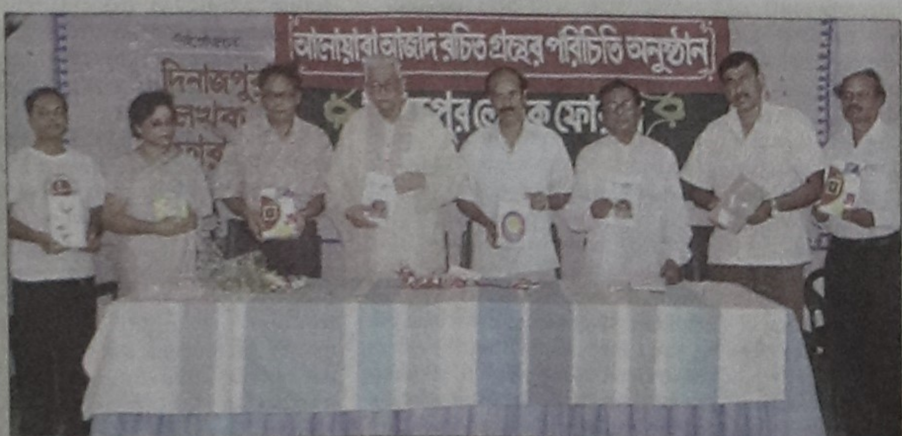
The author (2-L) with discussants at the book launch.