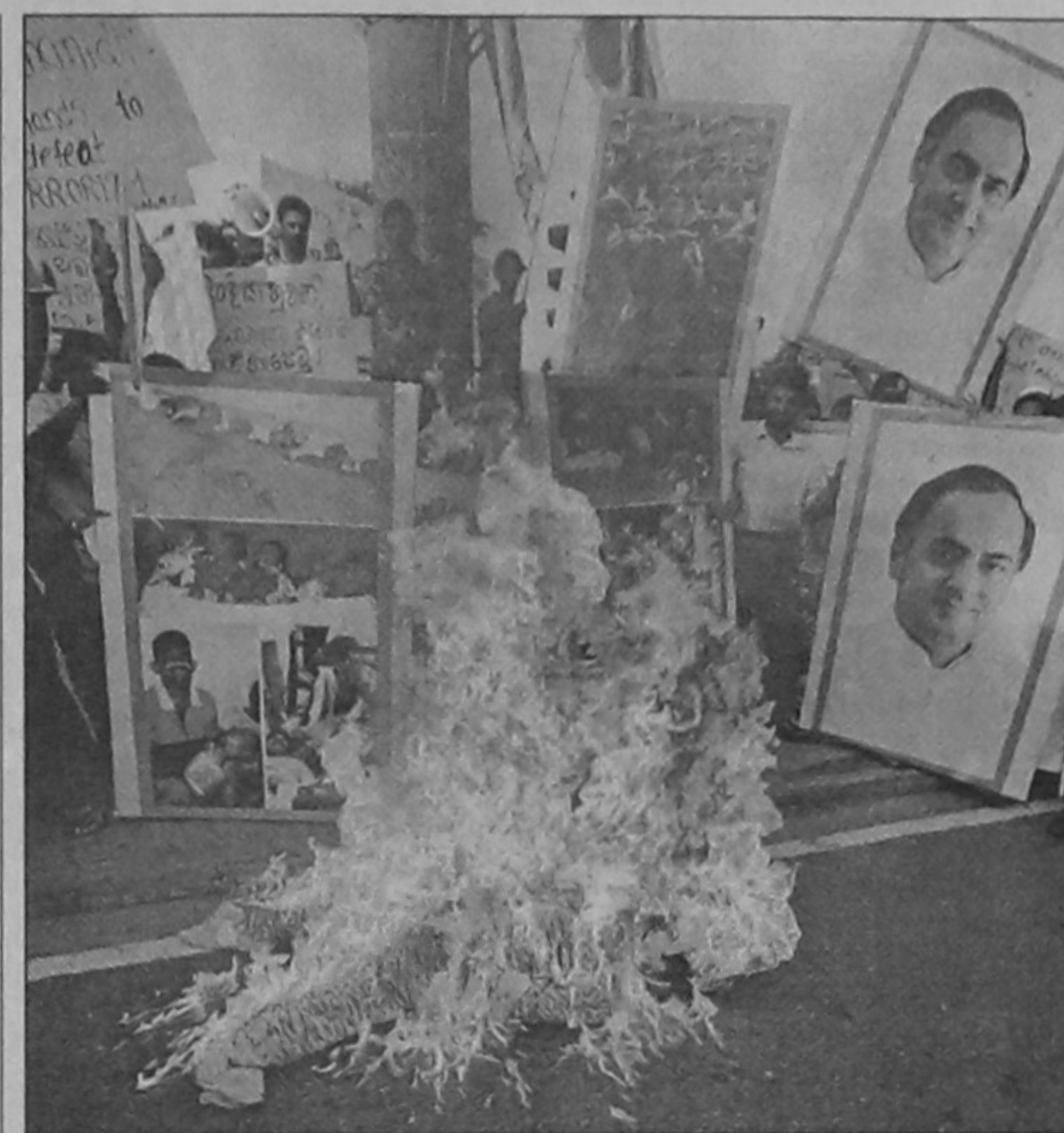
A group of Sri Lankan activists burn an effigy of the rebel Tamil Tiger leader Velupillai Prabhakaran in Colombo yesterday. The demonstrators urged neighbouring India to stay away from meddling in the government's military drive to crush the Tamil Tiger rebels.

"(Negotiations) cannot advance during the election period with us and the United States," said Interior Minister and Kadima MP Meir Sheetrit.