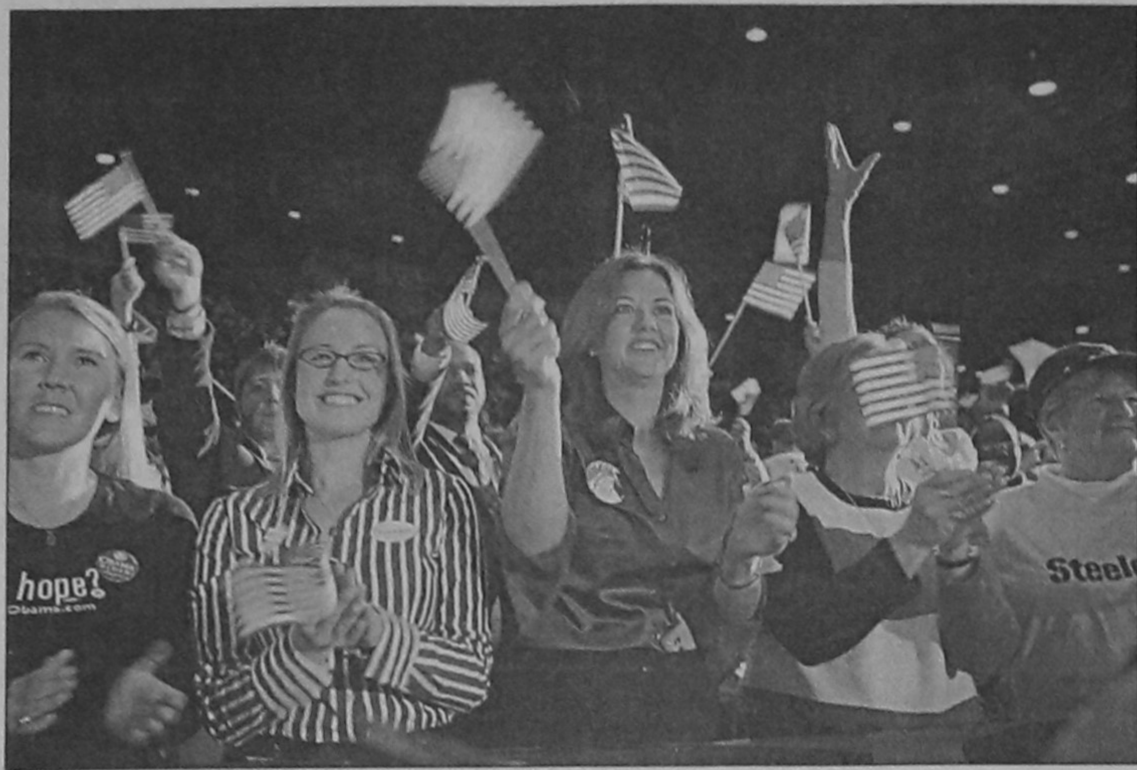
People cheer as Democratic presidential nominee US Sen Barack Obama (D-IL) speaks during a campaign rally at Canton Civic Centre on Monday in Canton, Ohio. Obama continues to campaign with less than a week before the election on November 4.