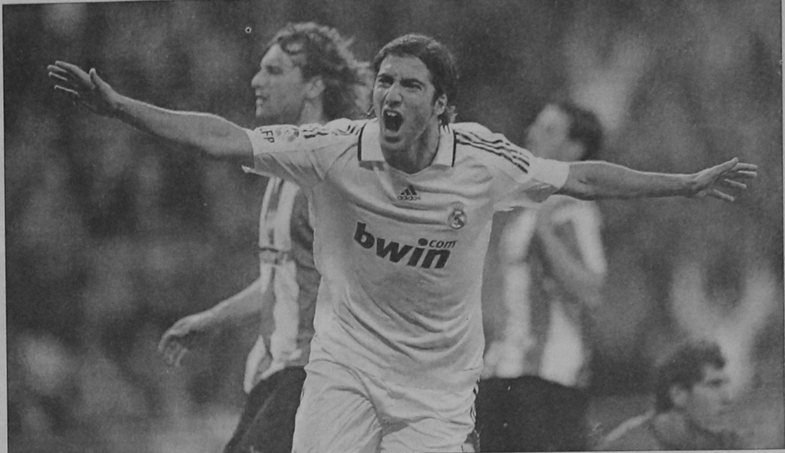
Real Madrid striker Gonzalo Higuain is ecstatic after scoring against Athletic Bilbao during their Primera Liga encounter at Santiago Bernabeu on Sunday.

FIFPRO TEAM: Iker Casillas (Real Madrid), Sergio Ramos (Real Madrid), John Terry (Chelsea), Rio Ferdinand (Manchester United), Carles Puyol (Barcelona), Steven Gerrard (Liverpool), Kaka (AC Milan), Xavi (Barcelona), Lionel Messi (Barcelona), Fernando Torres (Liverpool), Cristiano Ronaldo (Manchester United).