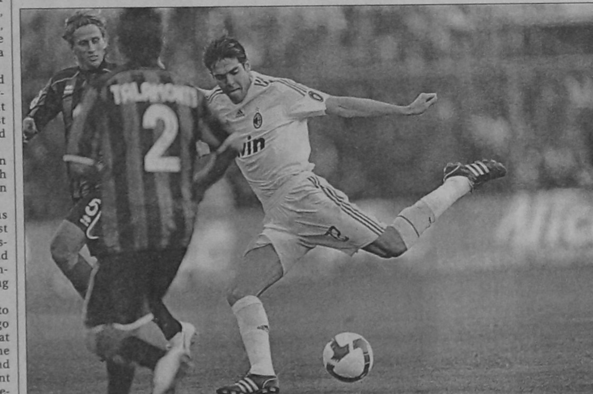
Milan star Kaka (R) shoots to score the all-important goal against Atalanta during their Serie A tie at the Azzurri D'Italia Stadium in Bergamo on Sunday.

"He didn't play well but he at least tried to do what I wanted. Others didn't. And with me those who think only about themselves and not about the team don't play."