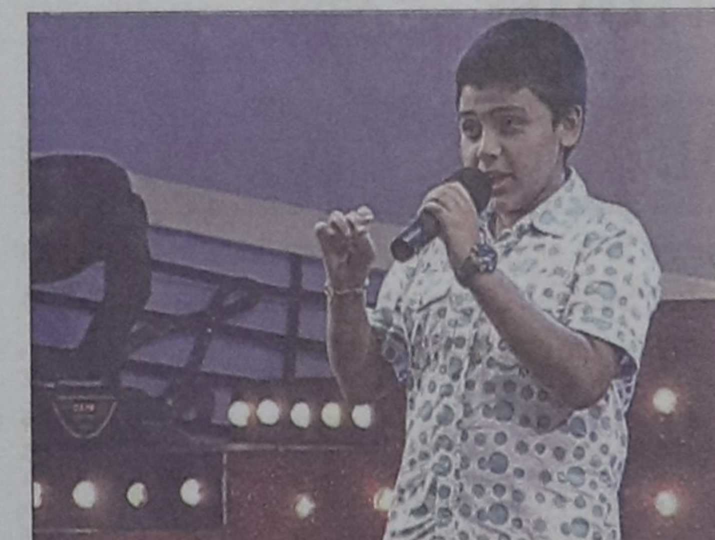
A young contestant sings on "Meridian Channel-i Khudey Gaanraaj".