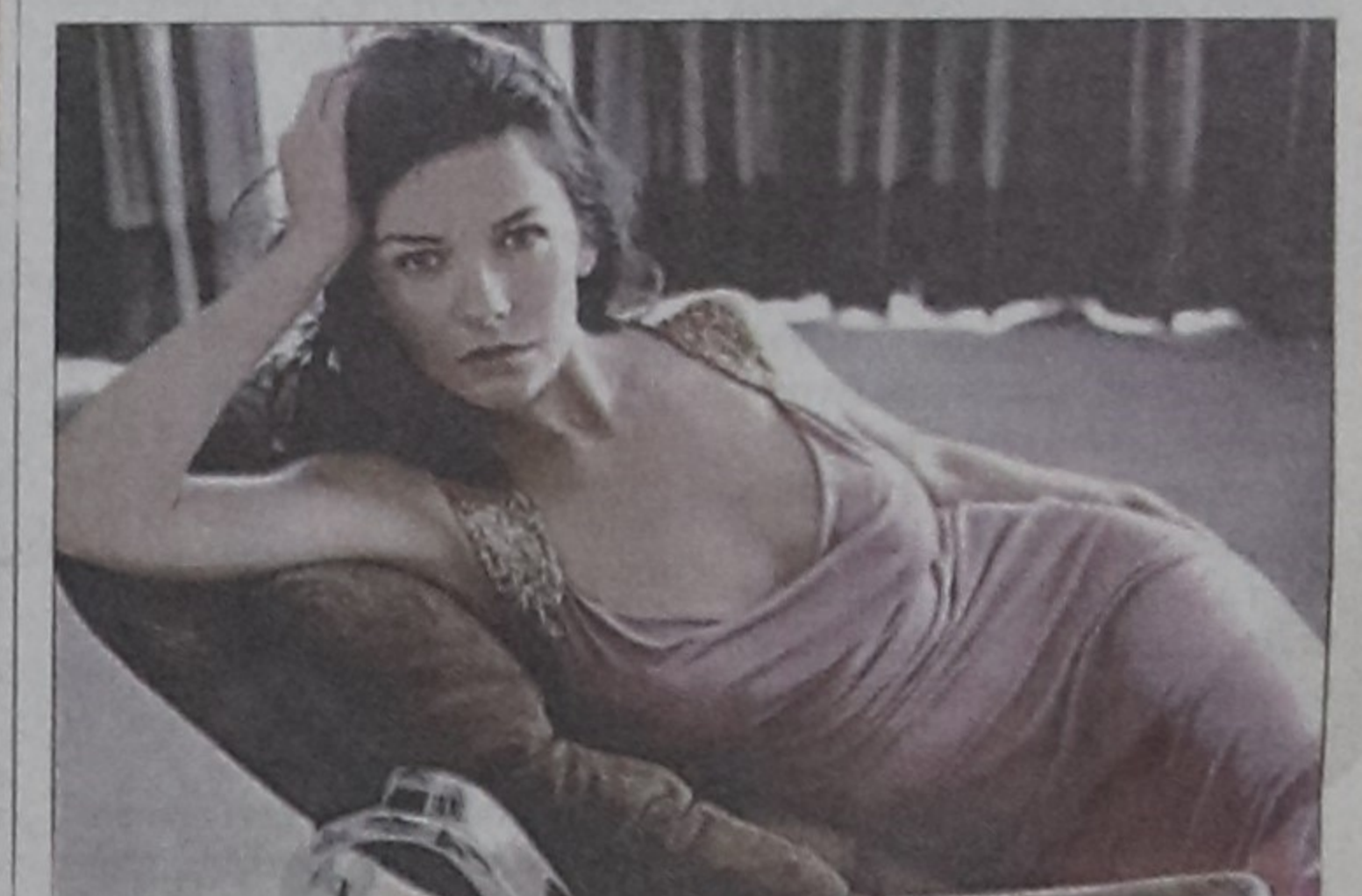
Catherine Zeta Jones won an Oscar for the film version of Chicago.