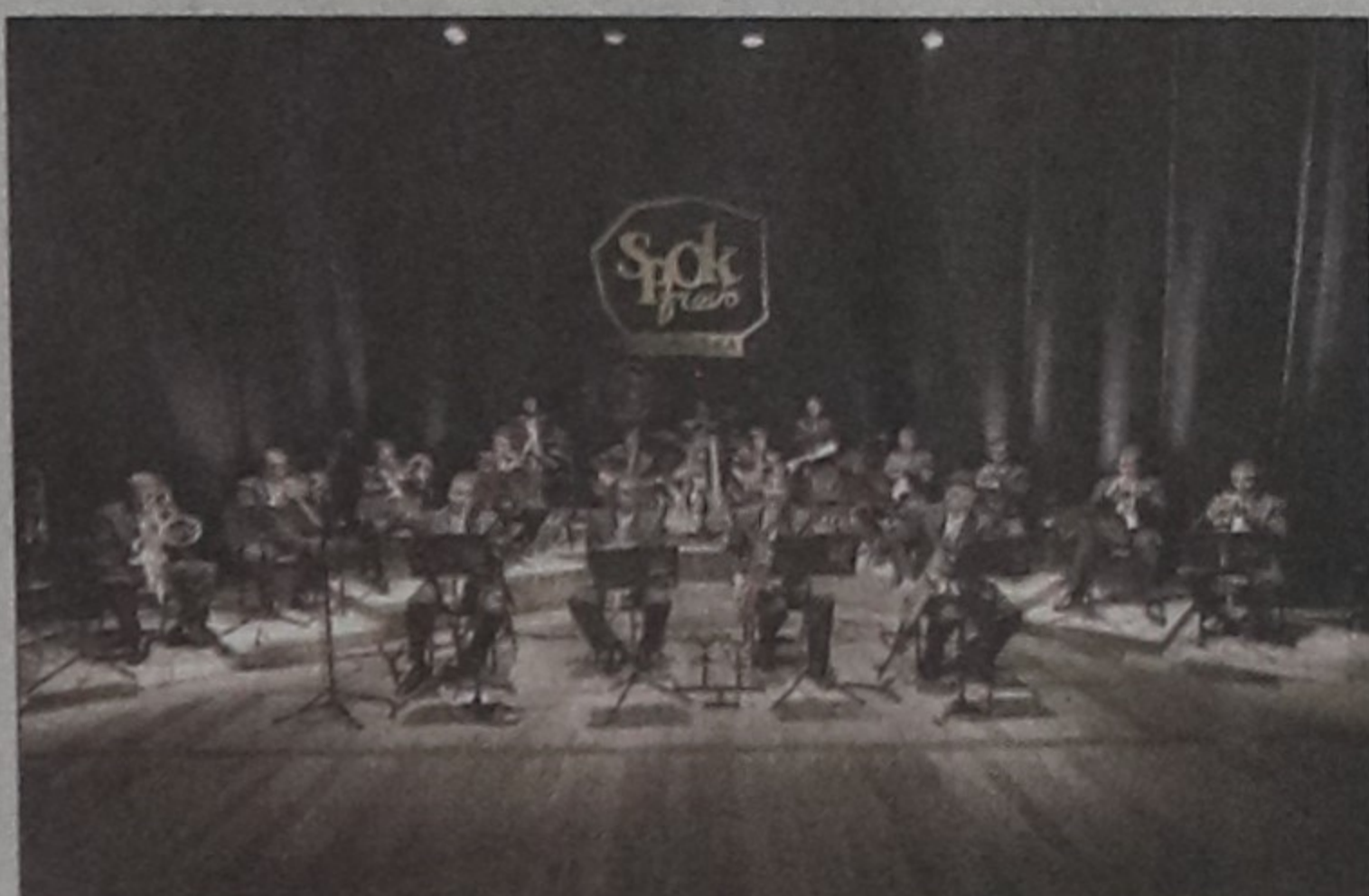
Brazilian musicians perform at the programme.