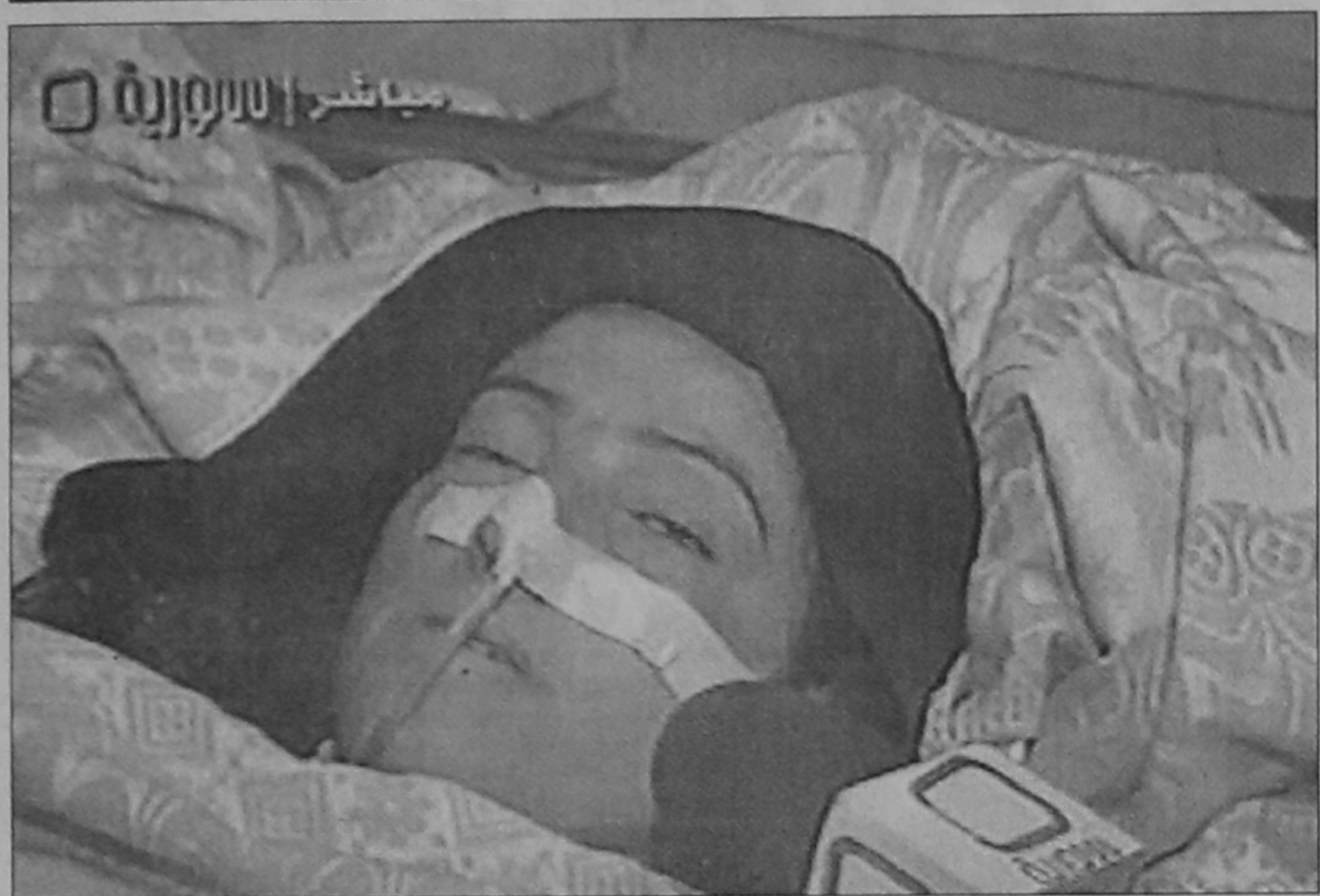
This image grab taken from the official Syrian television channel yesterday, shows a survivor of the US military attack on a building site in the Syrian village of Al-Sukkiraya...