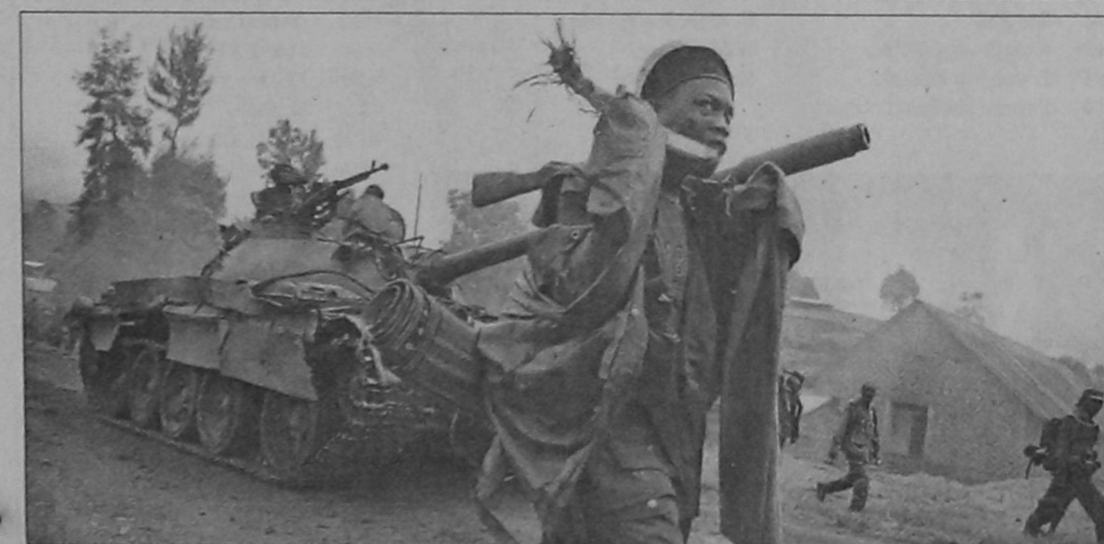
Congolese army soldiers withdraw from Kibumba about 35km north of the provincial capital Goma yesterday. Thousands of Congolese fled to Goma from Rugari and from the Kibumba Internally Displaced Peoples (IDP) camp after violence started between forces loyal to renegade general Laurent Nkunda and the Congolese army.