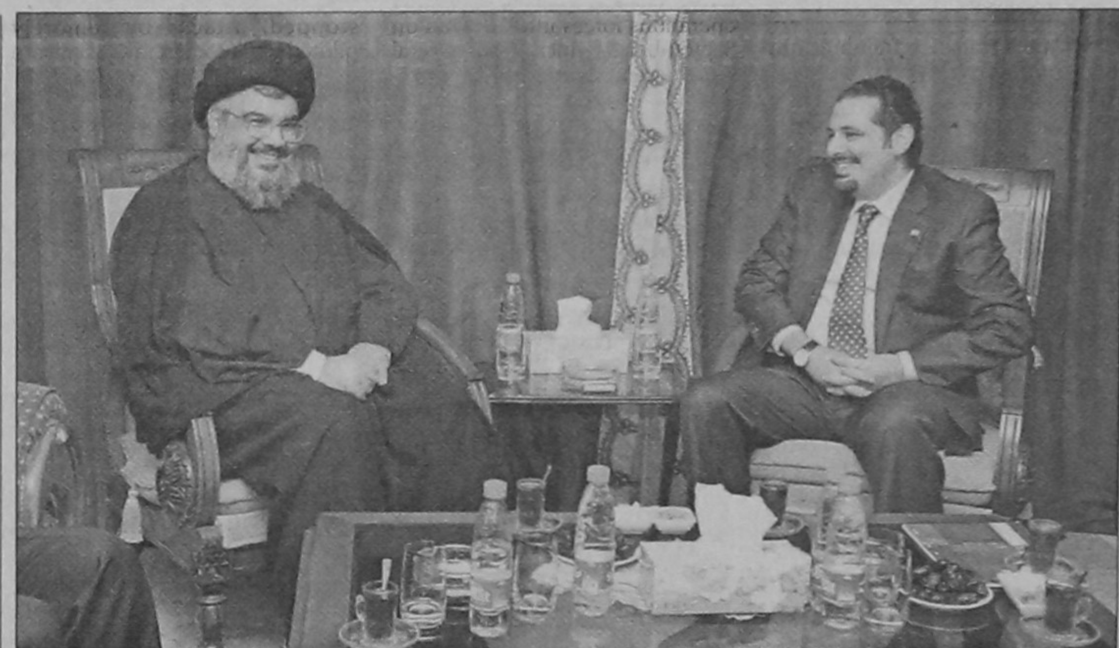
In a handout picture released by the Lebanese photo agency Dalati and Nohra yesterday, Lebanese Hezbollah chief Hassan Nasrallah (L) and Lebanese parliamentary majority leader Saad Hariri (R) smile during their first meeting in more than two years at an undisclosed location.