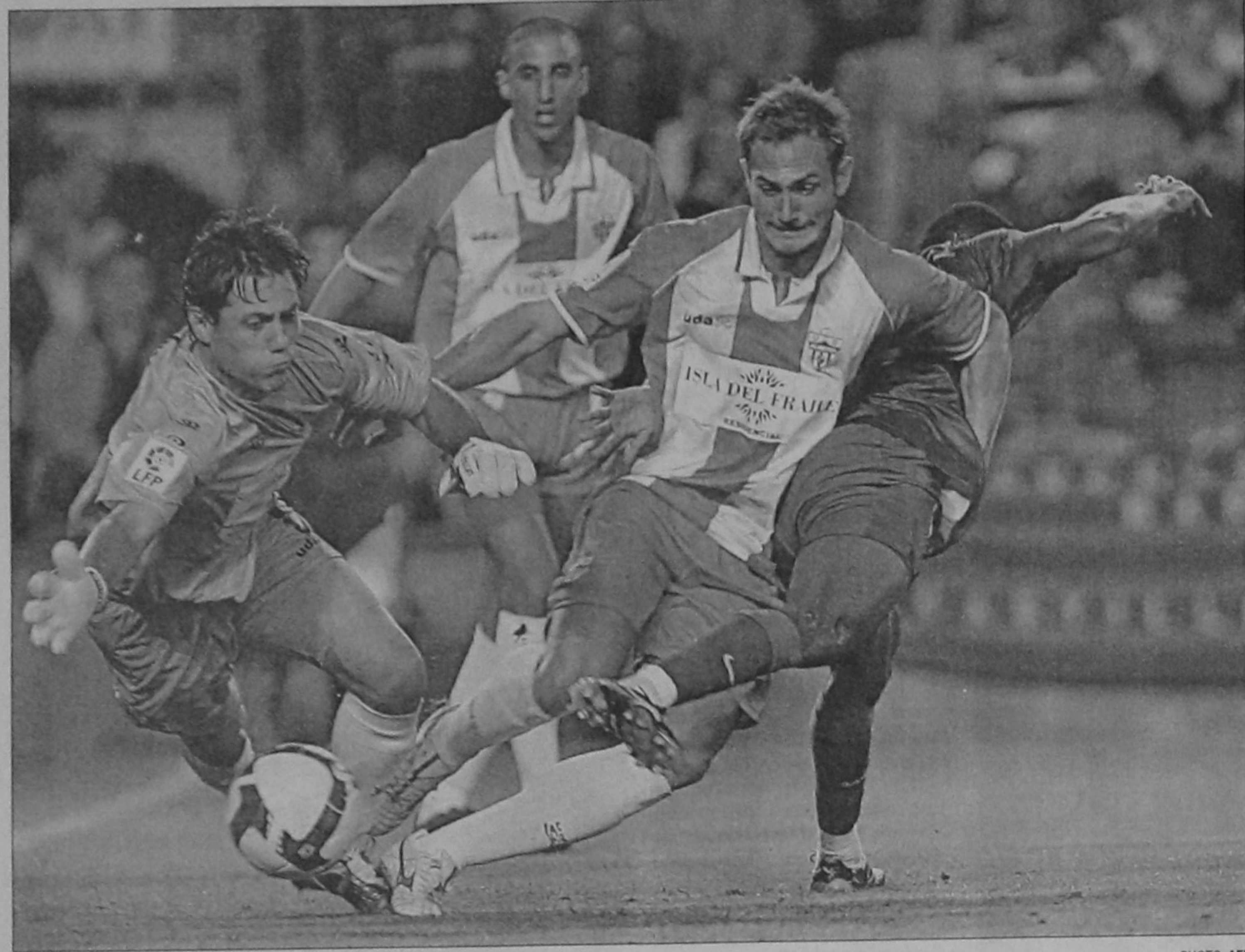
Barcelona striker Samuel Eto'o (R) scores a goal from a backheel against Almeria during their Primera Liga encounter at Nou Camp on Saturday. Eto'o scored a hat-trick in Barca's 5-0 rout of Almeria.