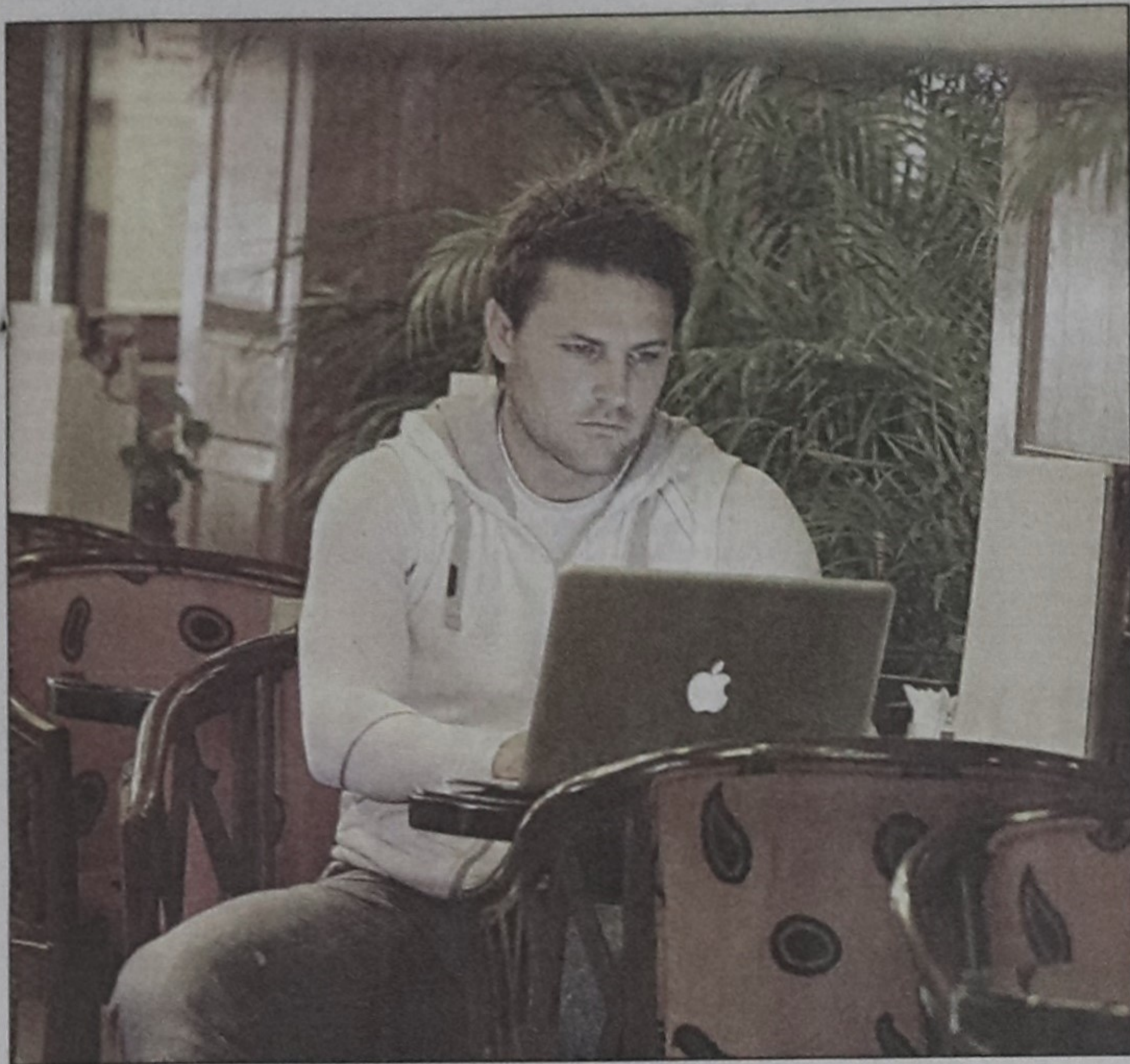
(L) New Zealand wicketkeeper Brendon McCullum works on his laptop while (R) Tamim Iqbal (R), Mushfiqur Rahim (C) and Shakib Al Hasan share a joke at the team hotel yesterday.