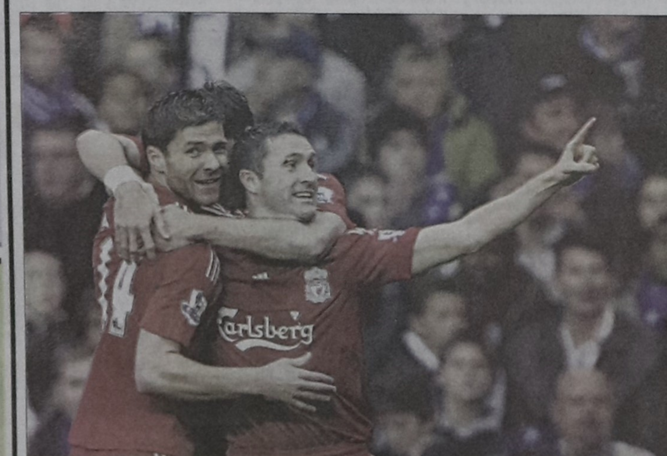
Liverpool midfielder Xavi Alonso (L) celebrates with teammate Robbie Keane (R) after scoring the all-important goal against Chelsea during their Premier League match at Stamford Bridge on Sunday.