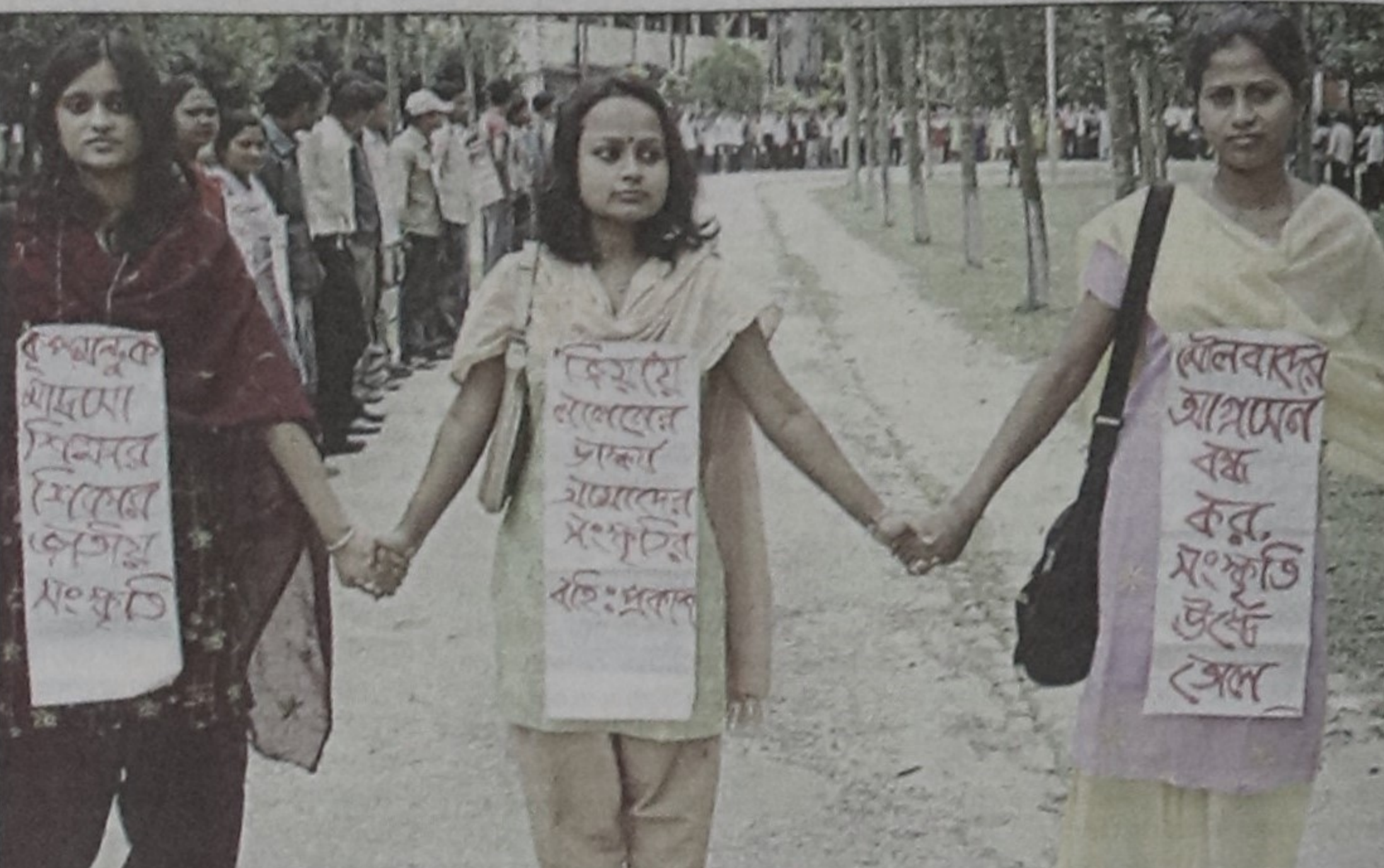
Cultural organisations form a human chain on the premises of Dinajpur Government College yesterday demanding re-installation of baul sculpture near Zia International Airport in the capital.