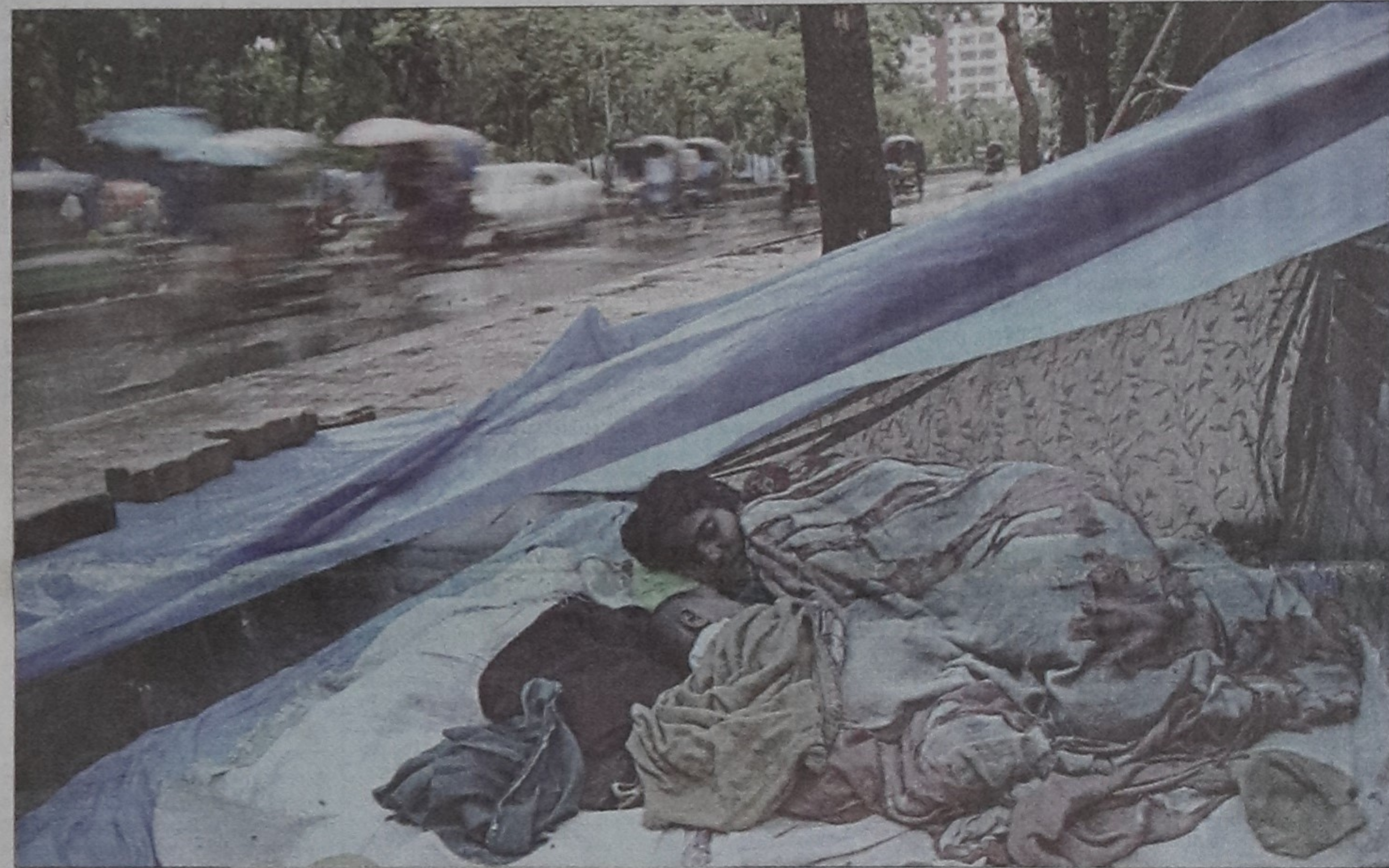
A homeless mother and her child sleep in a makeshift tent on a pavement in Dhaka University area yesterday as the depression in Bay brings in damp and chilly weather to the capital.

SEE PAGE 15 COL 3 RELATED STORY IN STAR BUSINESS