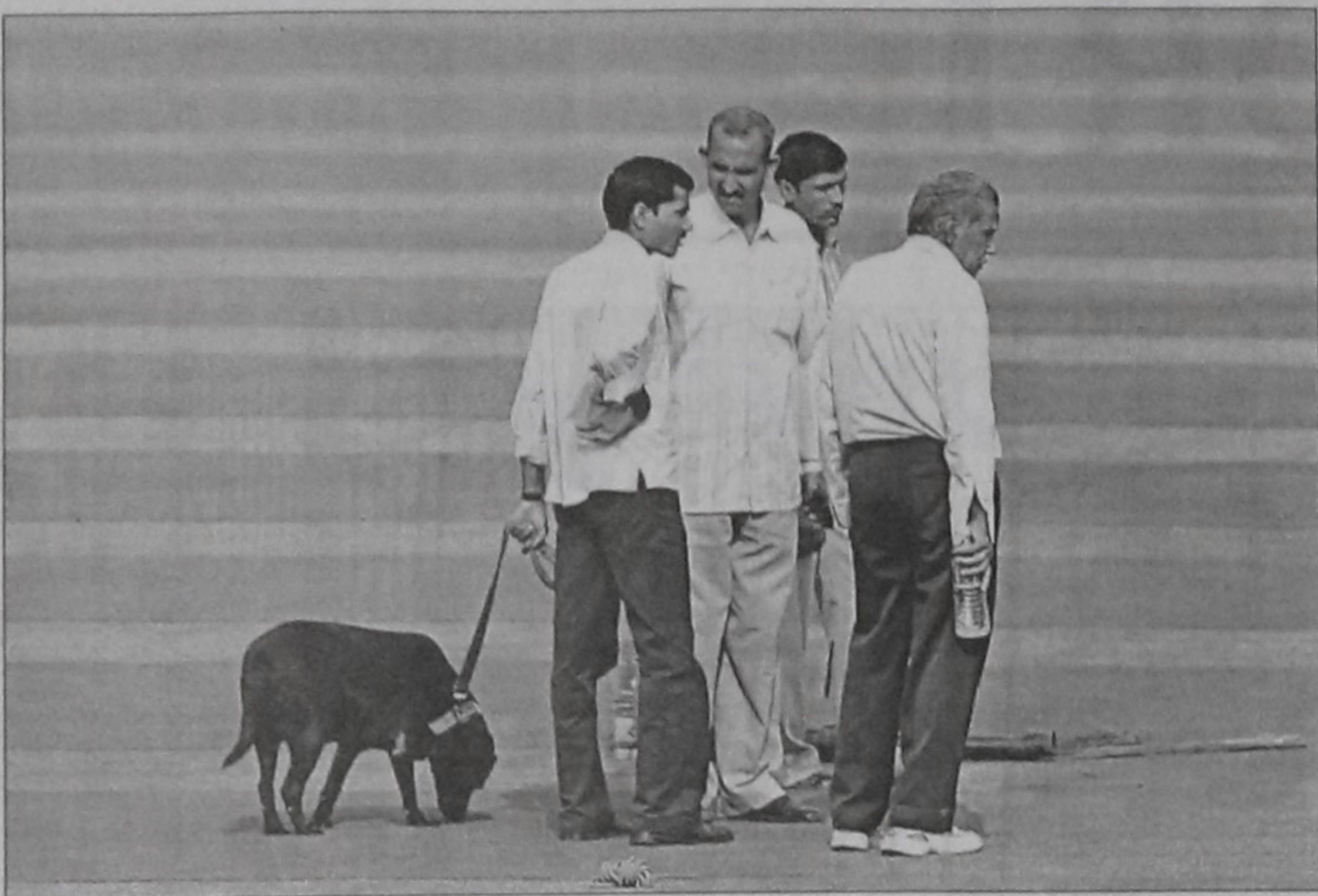
A sniffer dog was brought in by security officials at the Feroz Shah Kotla in Delhi yesterday to inspect the cricket pitch on which the third Test between India and Australia will be played from October 29. The hosts lead the 4-Test series 1-0.

John Newcombe and Tony Roche, both Australian, won most Grand Slam men's doubles titles, 12 - four Australian, two French, one US and five Wimbledon, between 1965 and 1976.