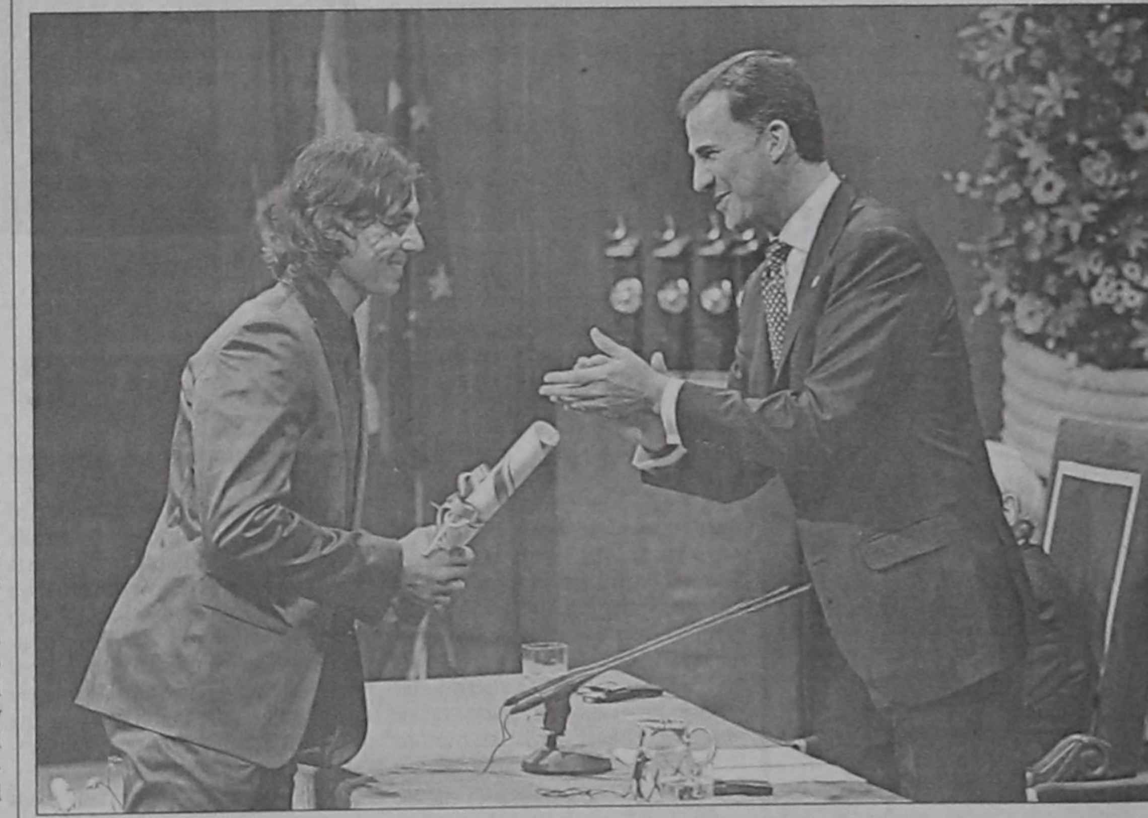
World number one Rafael Nadal (L) of Spain receives the Prince of Asturias Award Laureate for Sports from Spain's Prince Felipe during a ceremony at the Campoamor Theater in Oviedo on Friday.