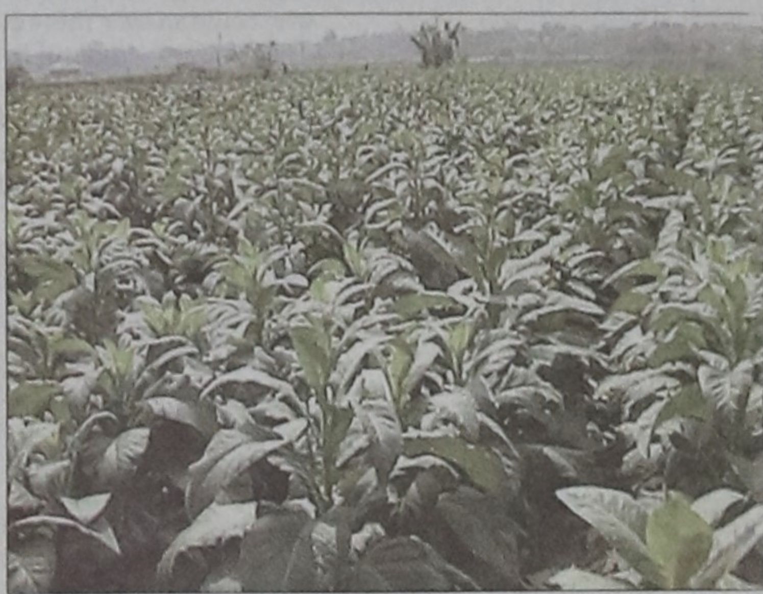
A vast tobacco field in Dighinala upazila in Khagrachhari.