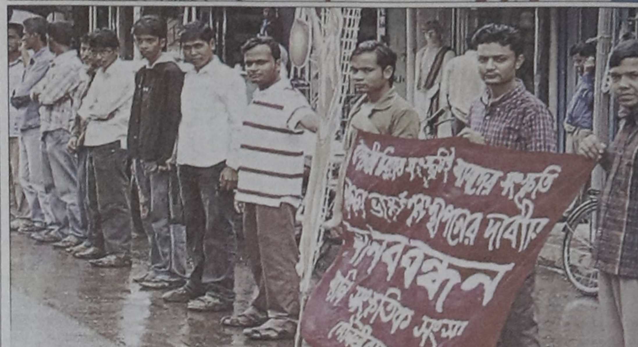
CULTURAL ACTIVISTS AGAINST BIGOTRY: Sammilita Sangskritik Jote forms a human chain at Satmatha in Bogra town, top, and Aroni Sangskritik Sangsad does the same at Moulvibazar yesterday protesting demolition of Lalon's statue in the capital.